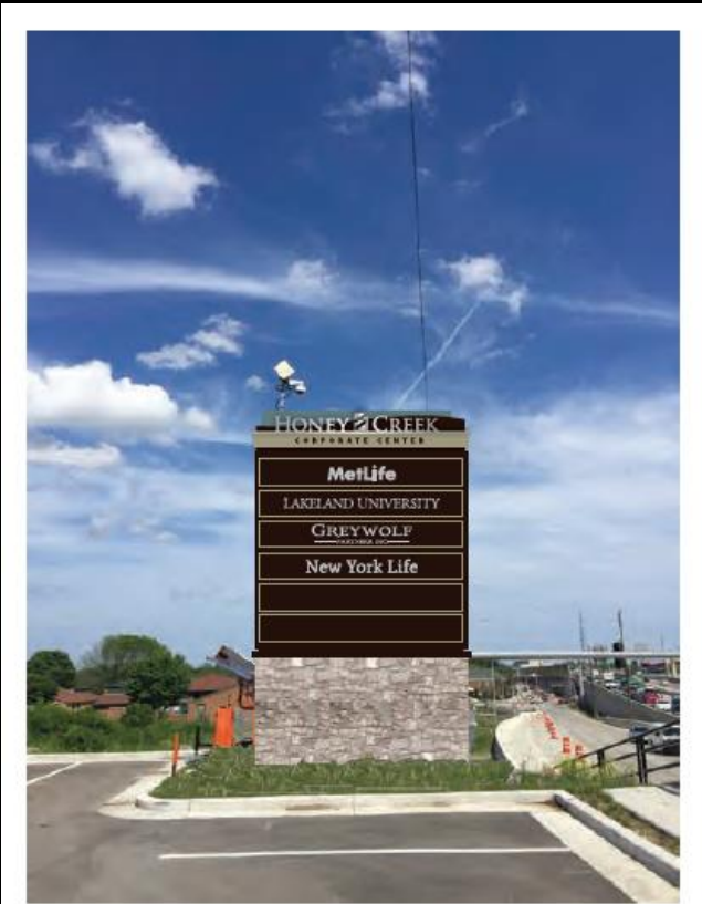
proposed location - approx. size & location