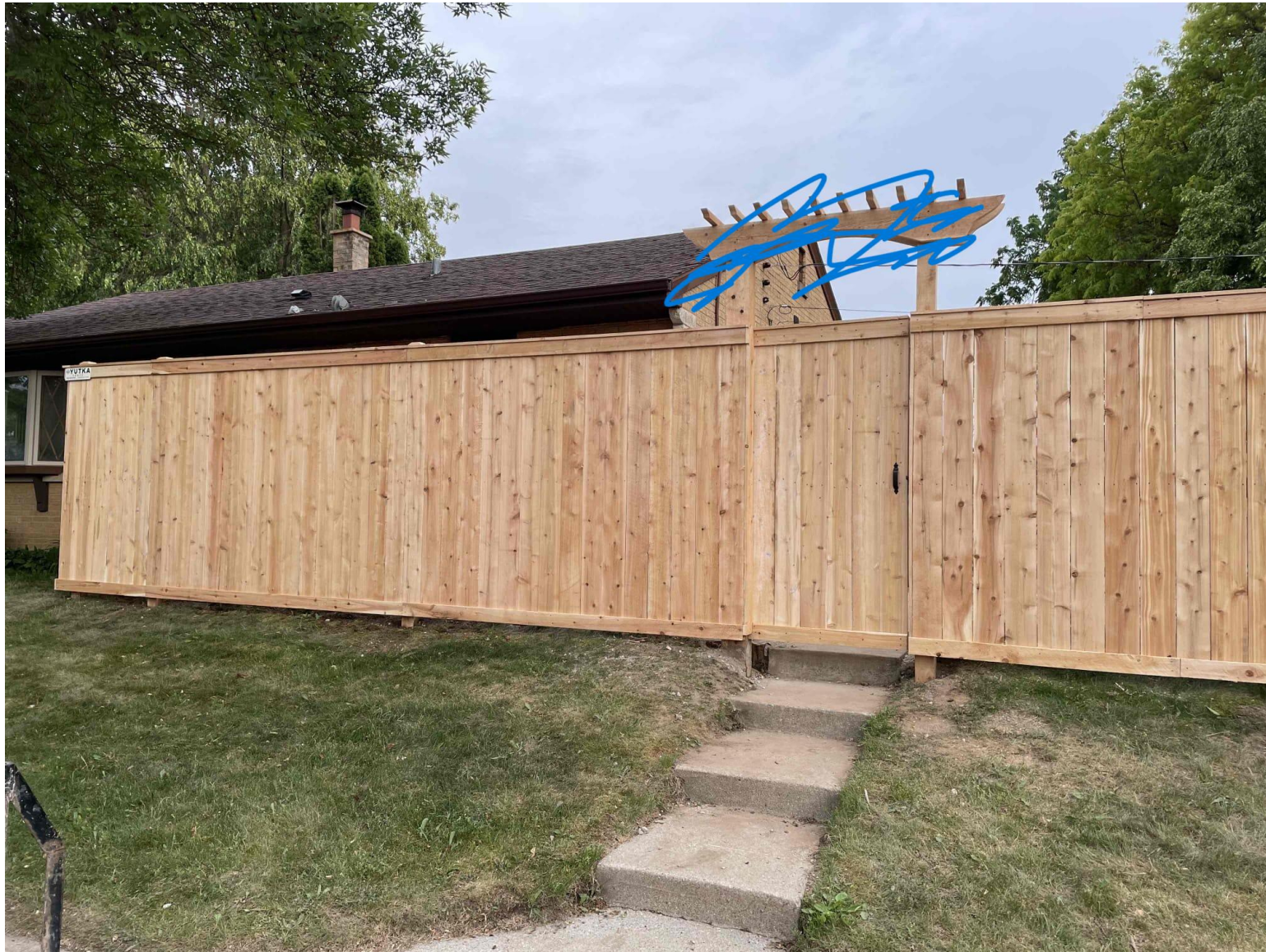
Fence design, disregard arbor/pergola.