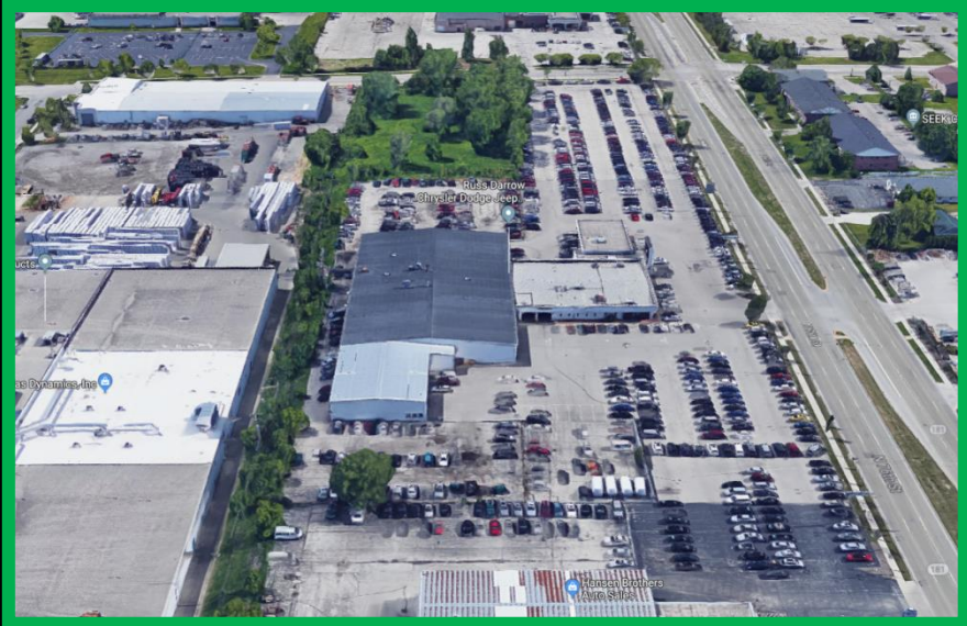
Aerial view looking south