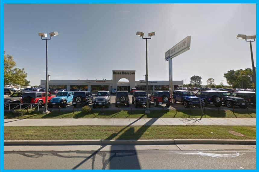
View from West Becher Street looking north