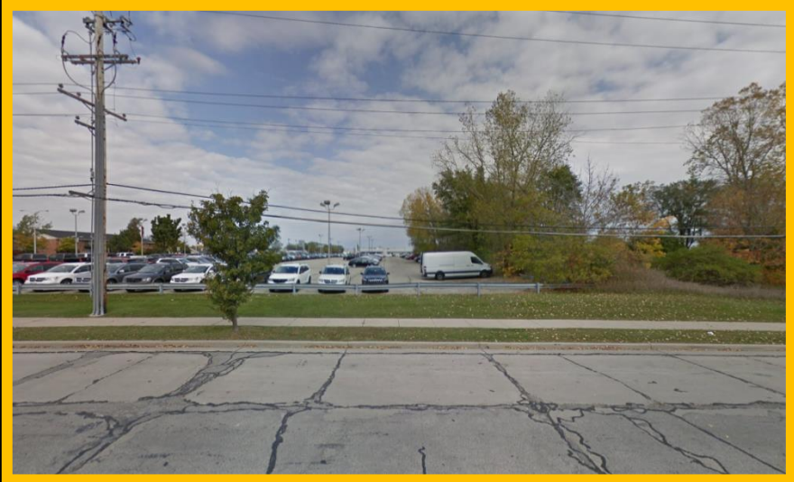
View from South Muskego Avenue south-east