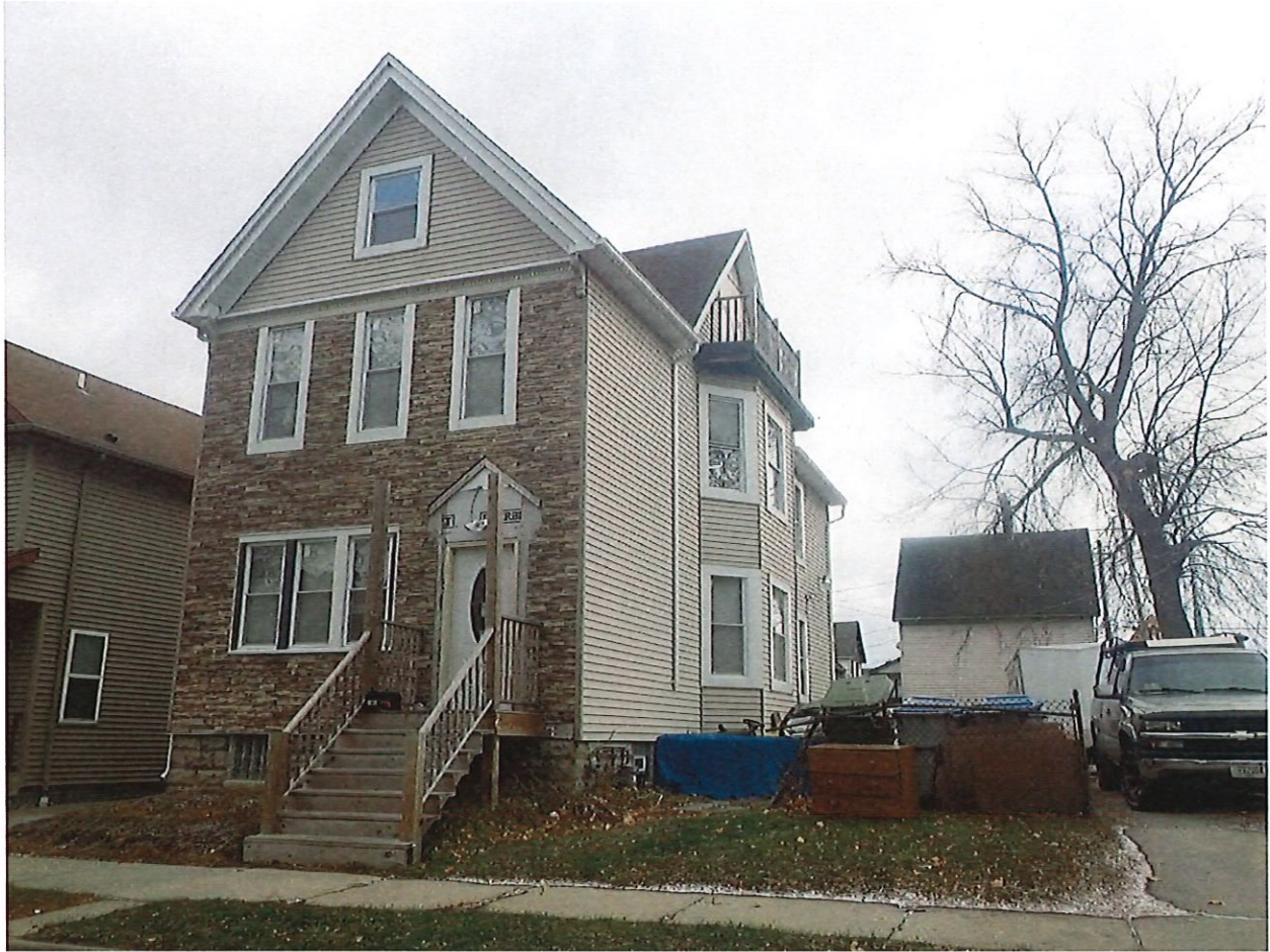
1832 North 18 th Street