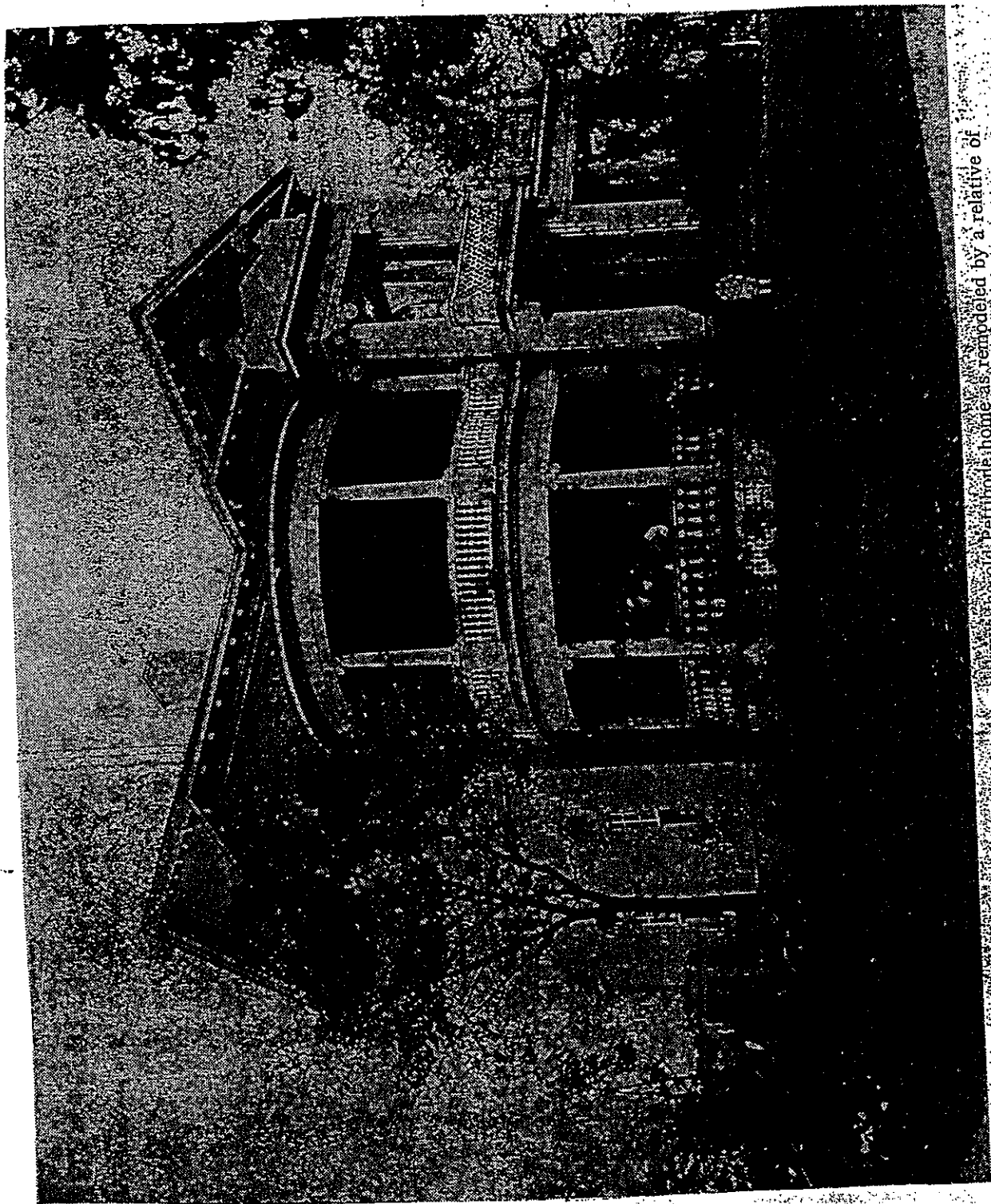
Taken between 1905 and 1920, this picture shows the old Pettibone home as remodelled by a relative of the second owner in an attempt (not too well done, some say) to follow the resurgence of the Classical style popular at the time. The result is somewhat reminiscent of a southern plantation house.