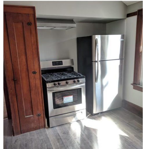
DCD home rehabilitation loans assist owners to improve and modernize their properties.

The following home rehabilitation loan products are available within 53206: