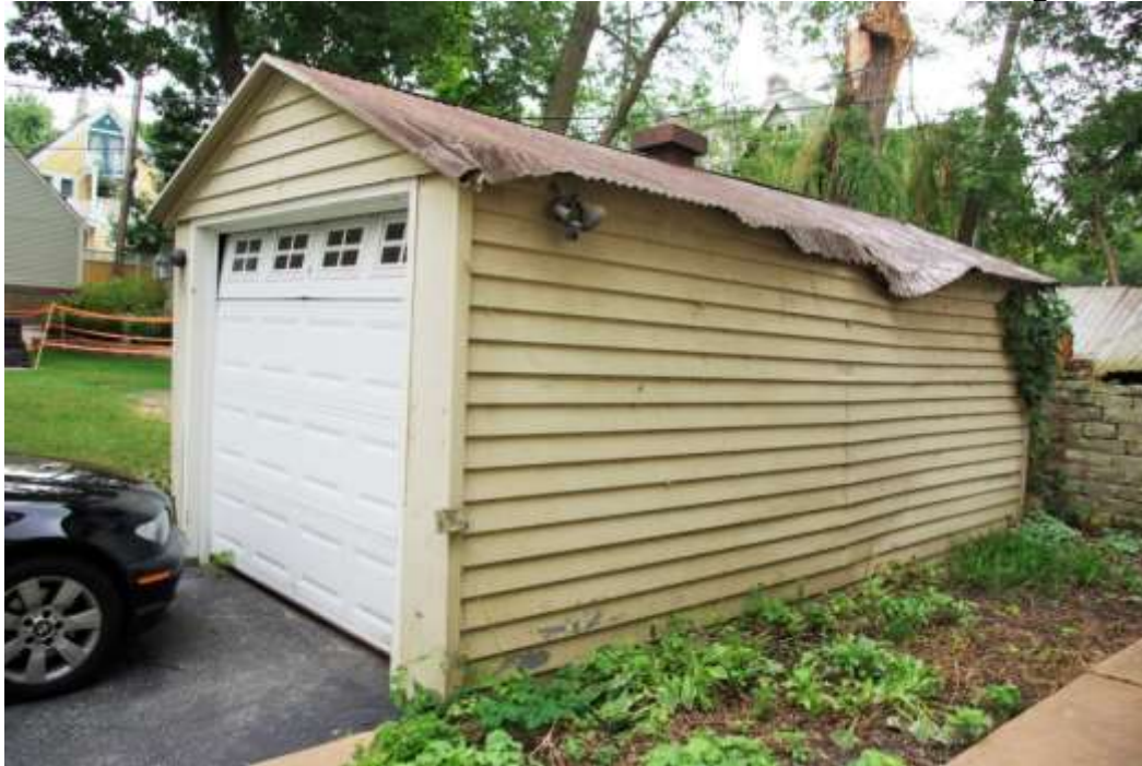
Damaged state of garage.