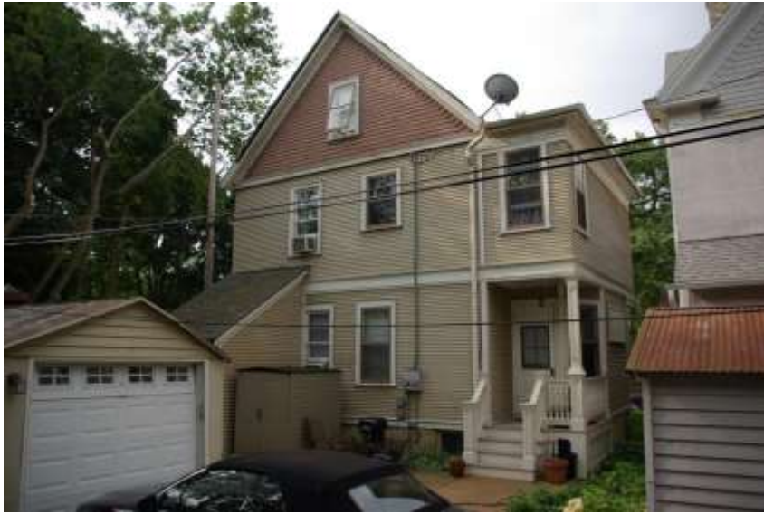
Garage in context at bottom left.