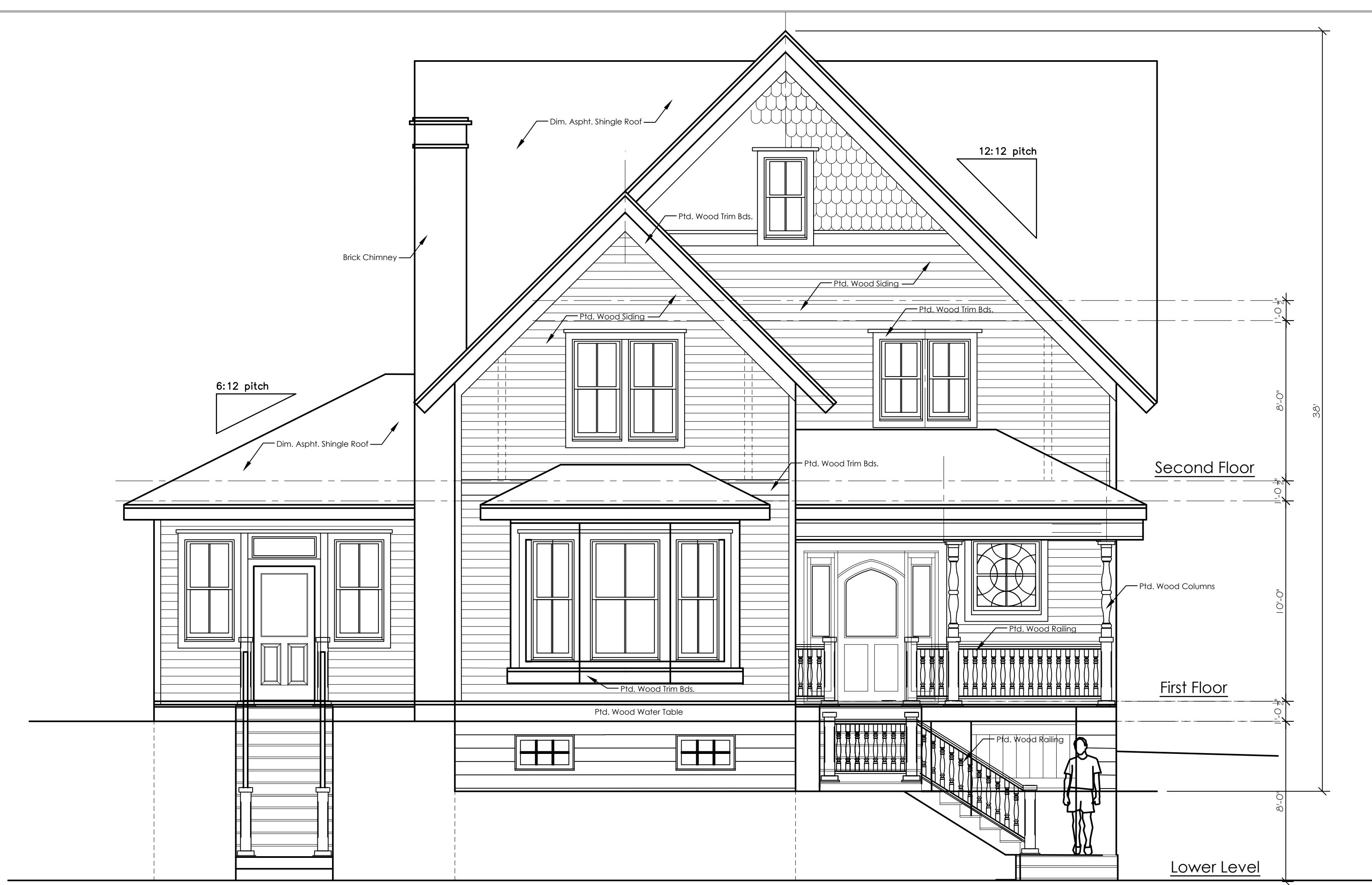
North (W. Brown St.) Elevation