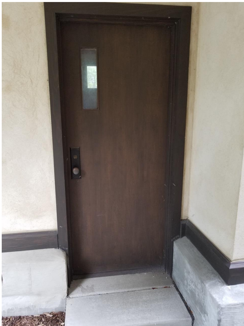
Door to be replicated, including glazing and hardware (from neighboring identical property)