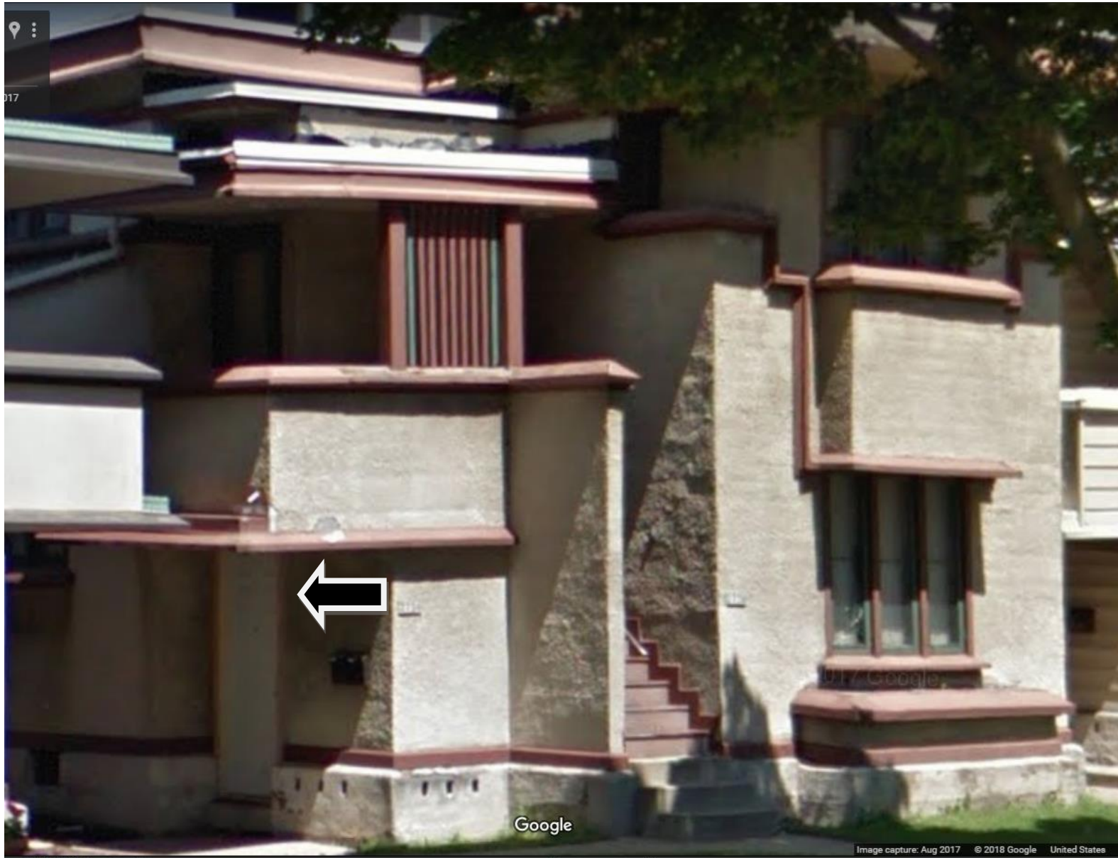
Door to be replaced.