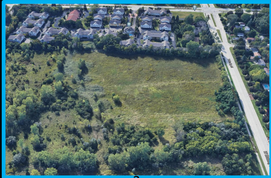
Aerial view looking west