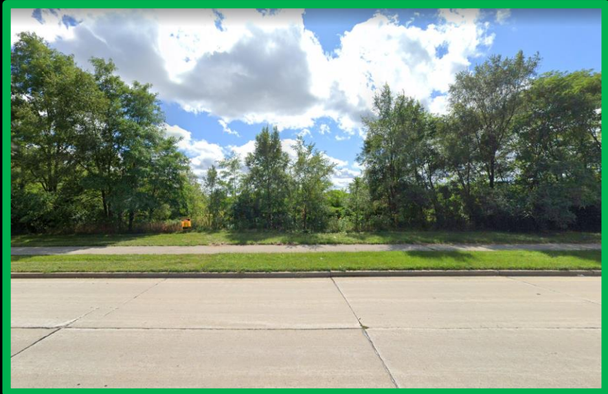
View from West Bradley Road looking south