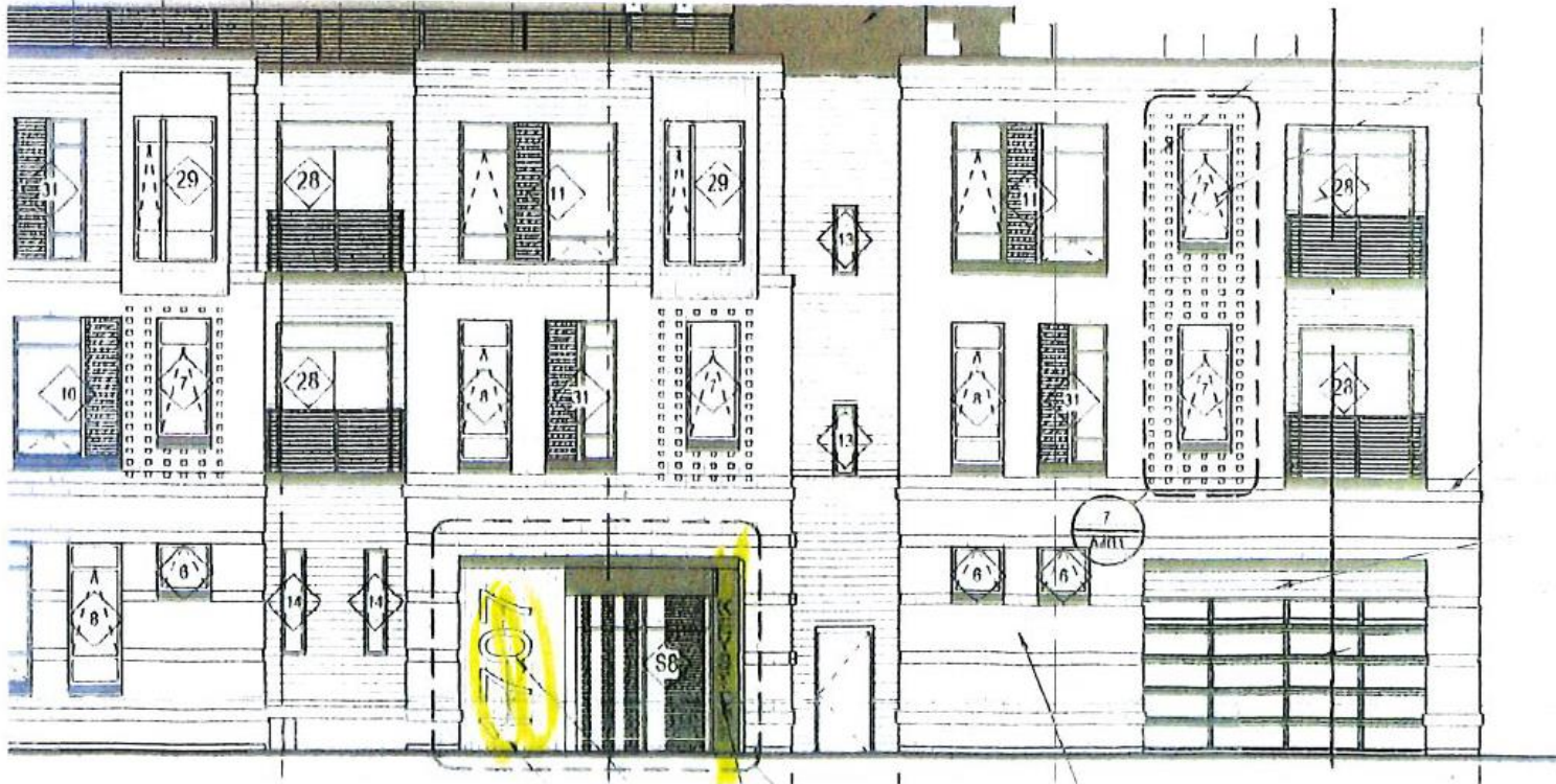
Elevation showing installation site at bottom center.