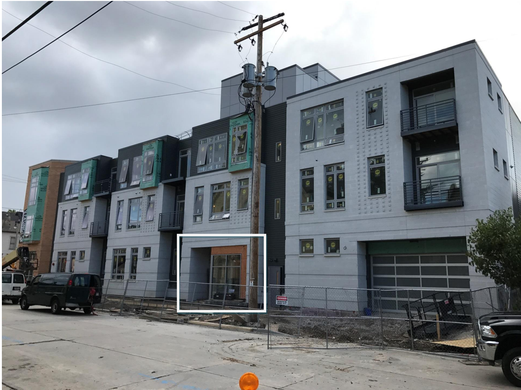
August 2017 view. Signs to be installed in highlighted area. Address numbers shall be in the recess.