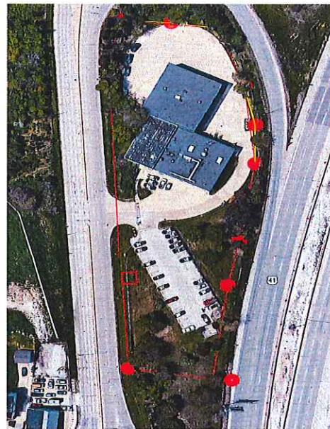
AERIAL PHOTO OF 4830 WEST STATE STREET