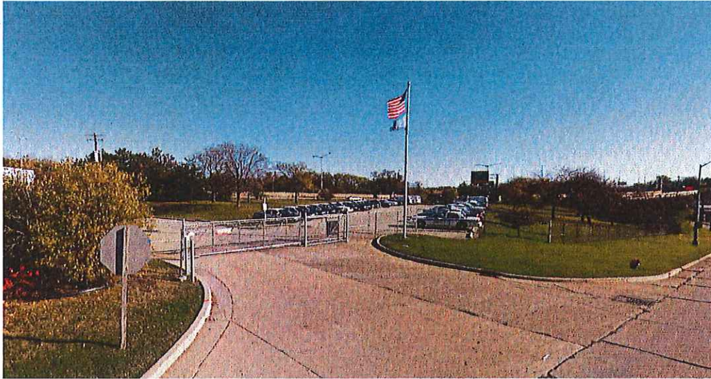
VIEW OF PARKING LOT LOOKING SOUTHEAST FROM ALOIS STREET