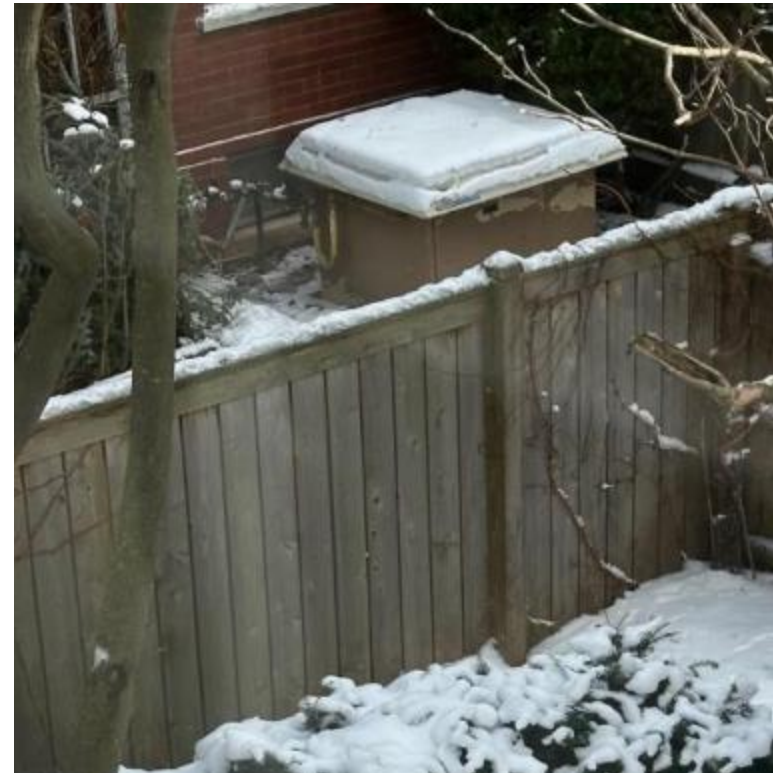
Fence location diagram by fence contractor