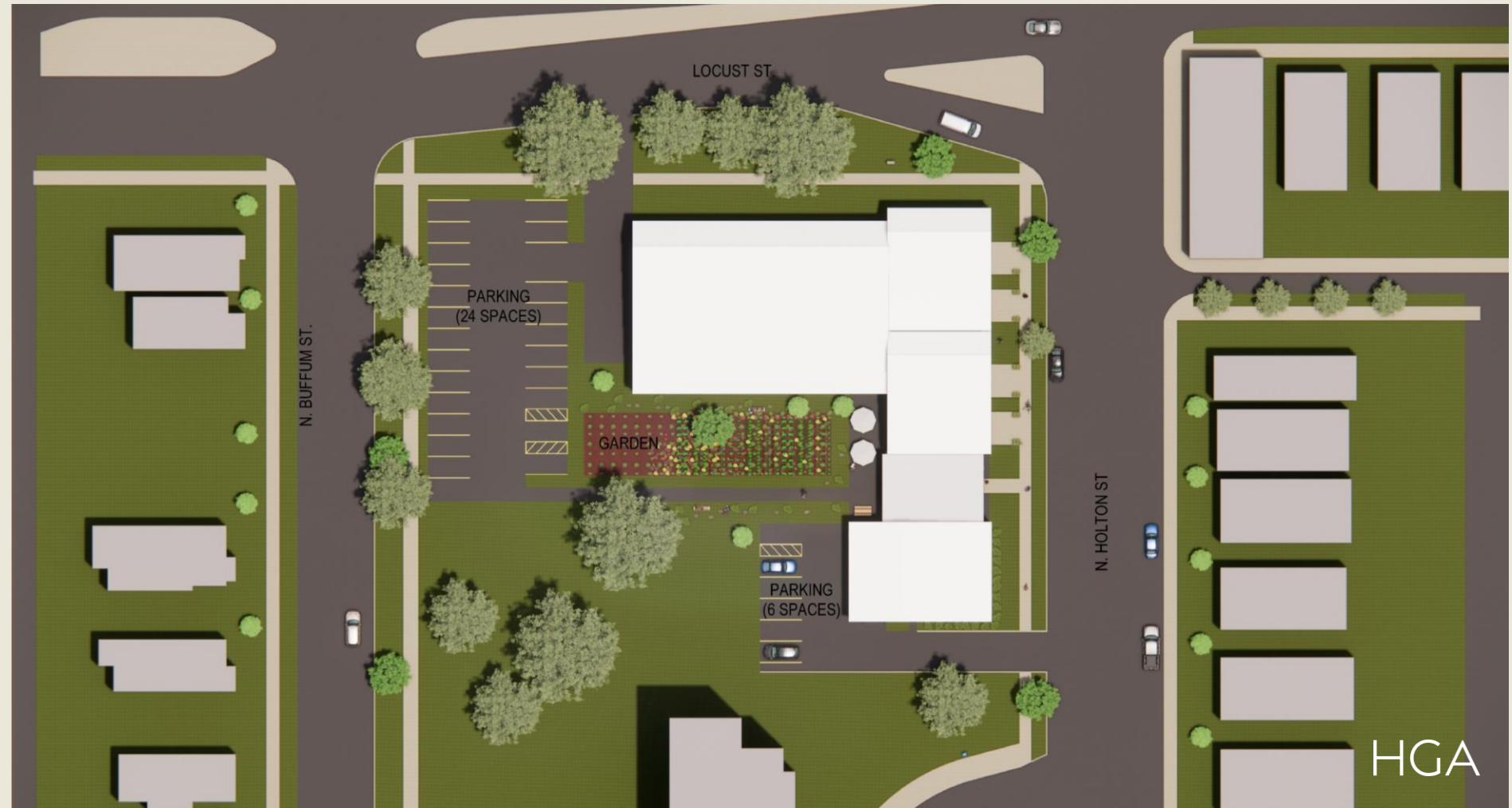
Aerial Site Plan

Kinship is putting a flag in the ground for Milwaukee to operate the first, but not the last, community food center to bring nourishment, belonging, and prosperity through the power of food. Kinship's new facility will be designed in a way that allows us to provide programs in an accessible, operationally safe and efficient manner, with room for growth to meet the community's evolving needs.