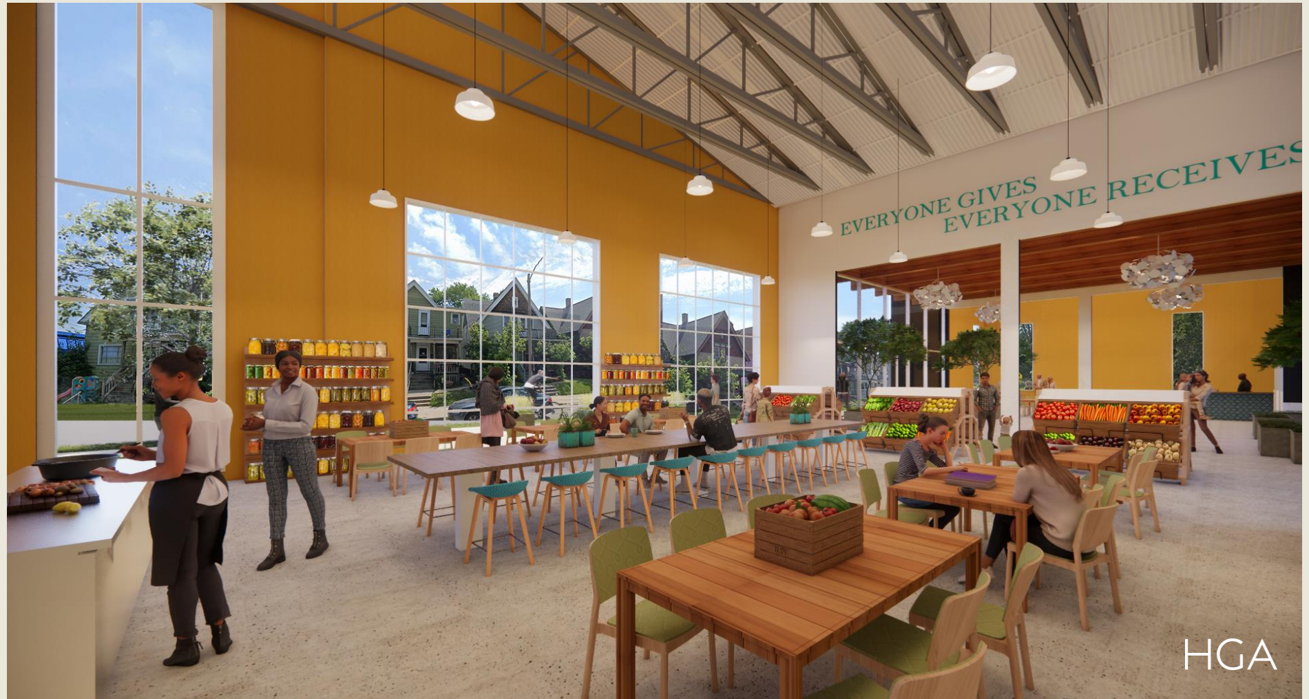
Rendering – Interior

Collaborative food preparation & demonstration kitchen for wellness education with breakfast, dinner, and juice bars.