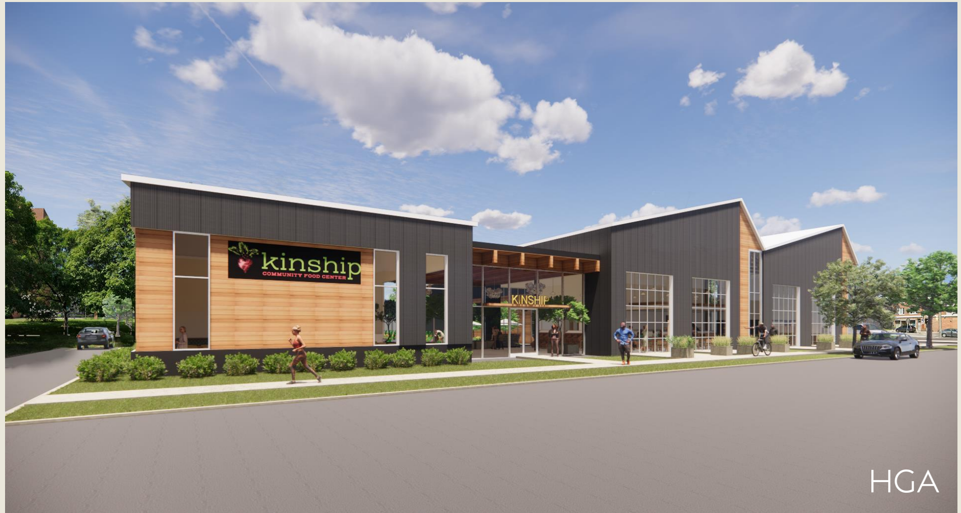
Rendering – Exterior

Human service consultations spaces for resource referrals, coaching, workshops & trainings.