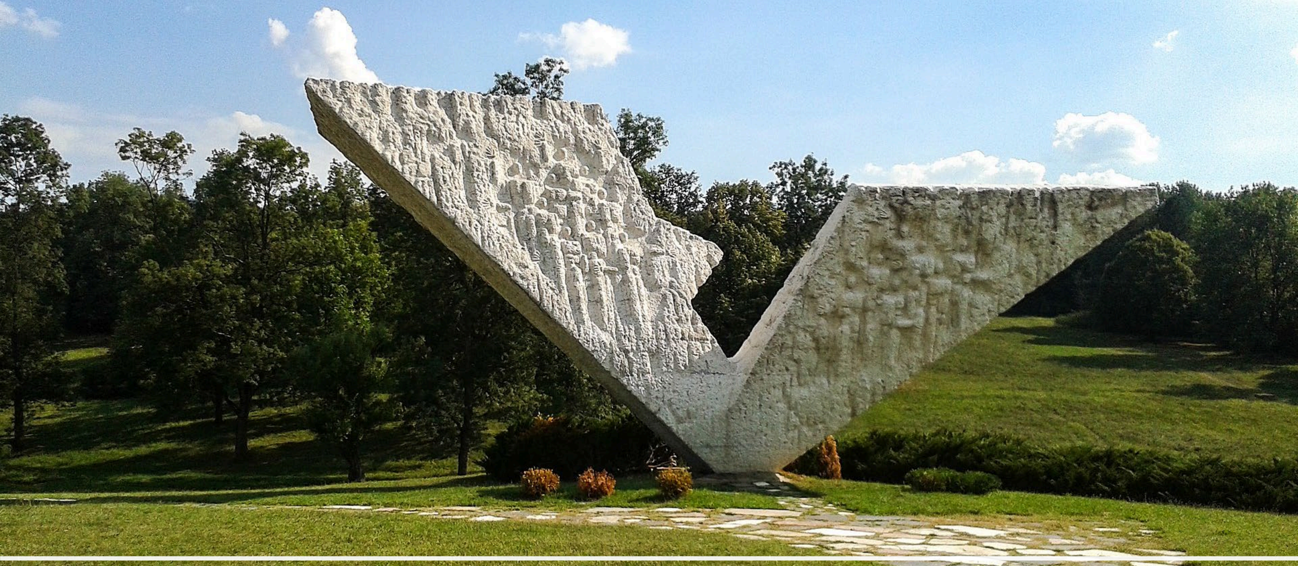
Sumarice Memorial Park