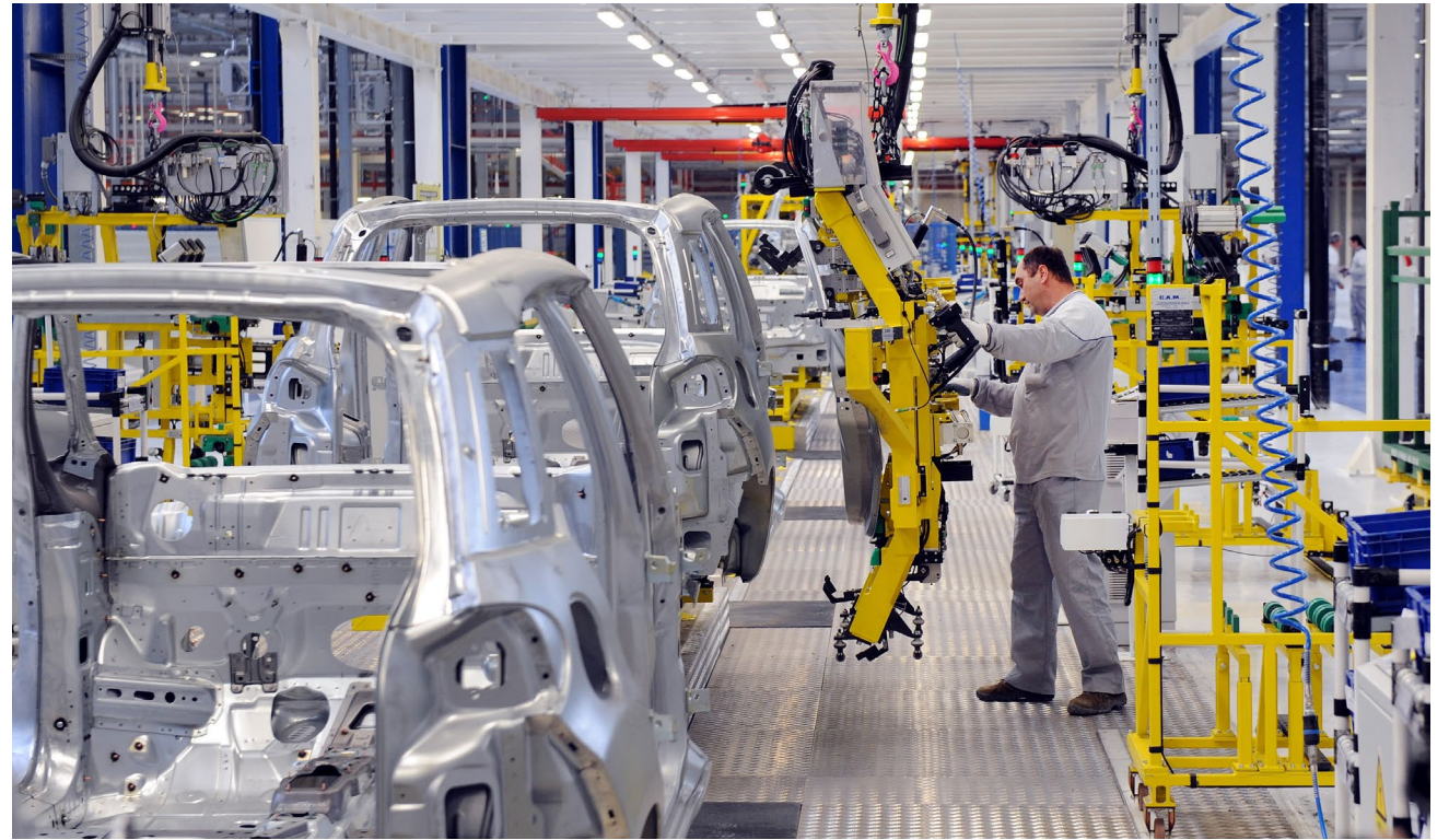
Worker assembling a car at the Fiat factory.