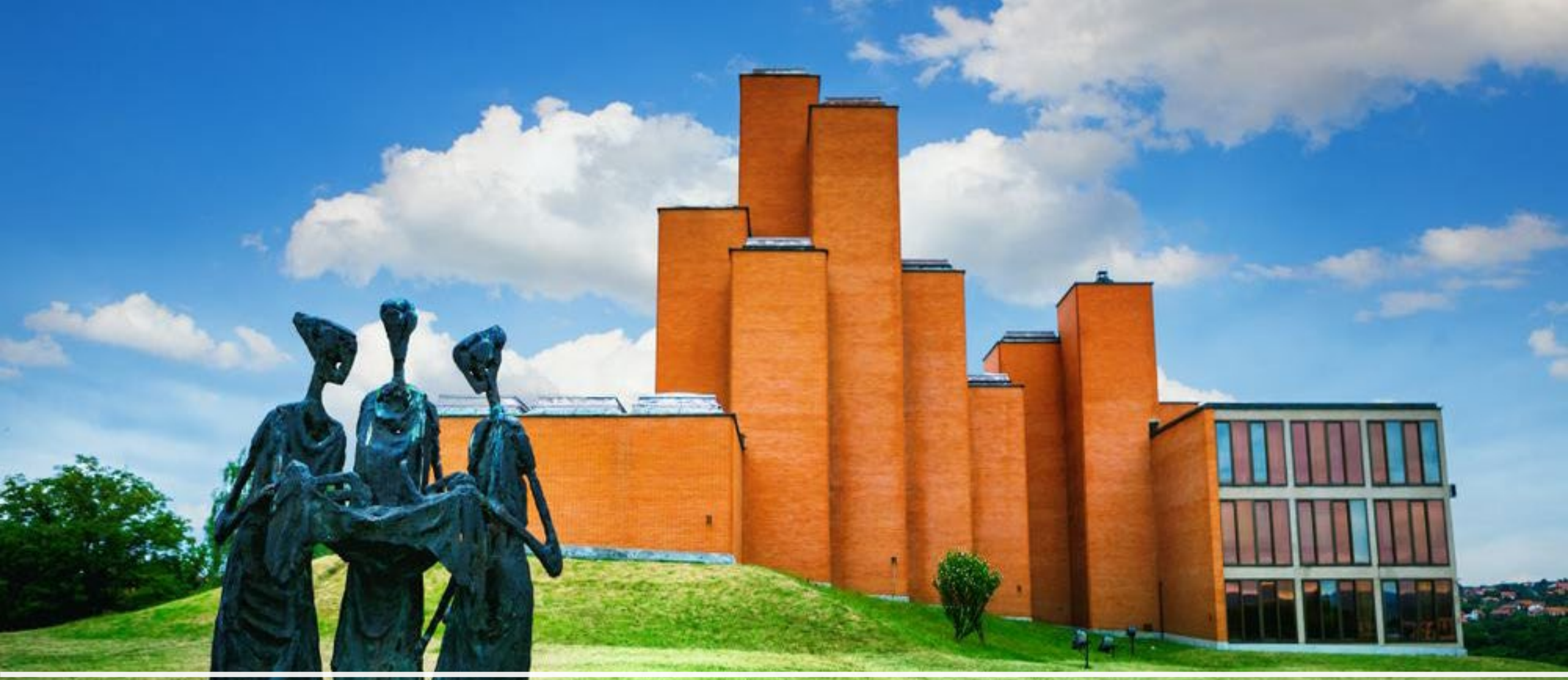
Sumarice Memorial Park