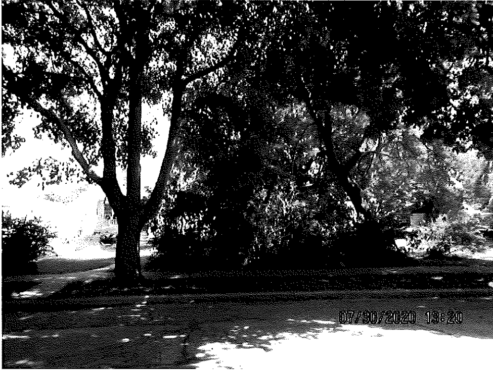
652-54 S 64 th Street