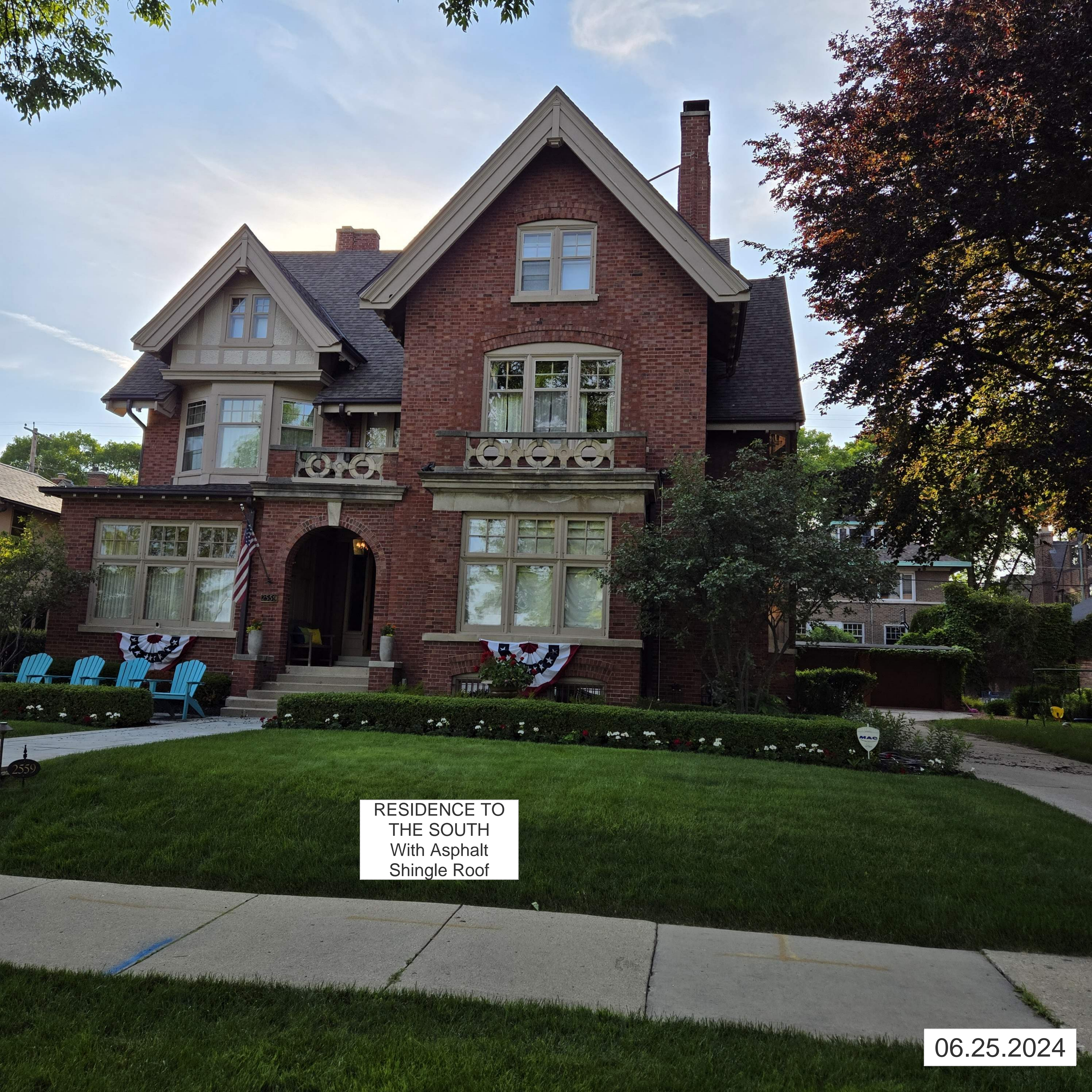
RESIDENCE TO THE SOUTH With Asphalt Shingle Roof