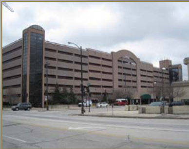
4 TH AND HIGHLAND