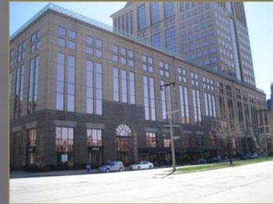
1000 NORTH WATER