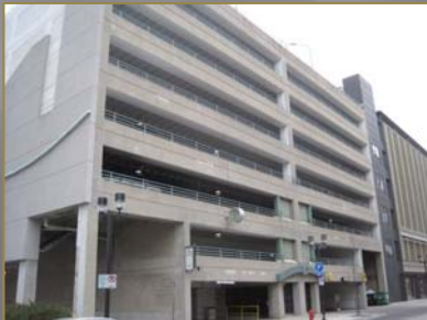
2 ND AND PLANKINTON