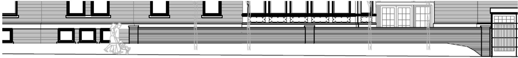
GARDEN WALL ELEVATION - SOLID 1" = 10'-0"