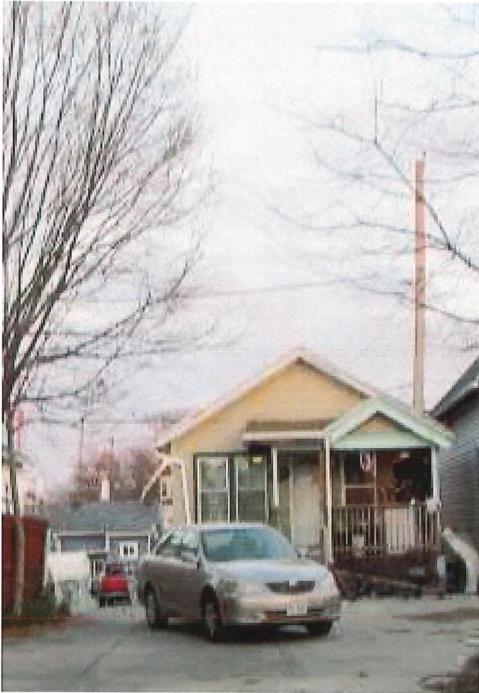
1524 S 15 th PI – single family home