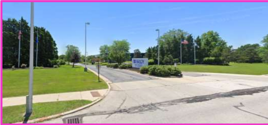
Area of building expansion