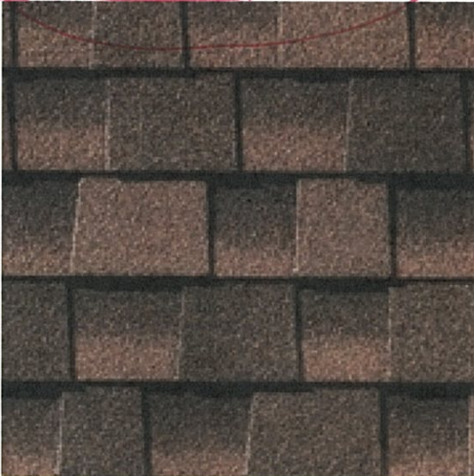
(/Residential_Roofing/Shingles/Timberline_HD_Formerly_Timberline_Prestige_30/Timberline_HD - Hickory)