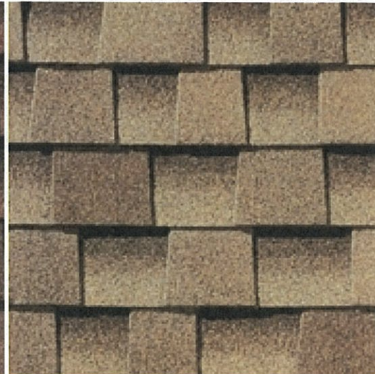
(/Residential_Roofing/Shingles/Timberline_HD_Formerly_Timberline_Prestige_30/Timberline_HD - Shakeswood)