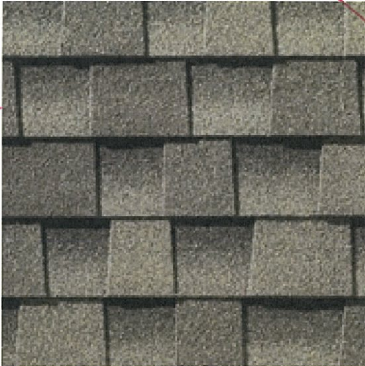
(/Residential_Roofing/Shingles/Timberline_HD_Formerly_Timberline_Prestige_30/Timberline_HD - Weathered Wood)