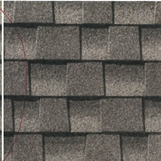
(/Residential_Roofing/Shingles/Timberline_HD_Formerly_Timberline_Prestige_30/Timberline_HD - Mission Brown)