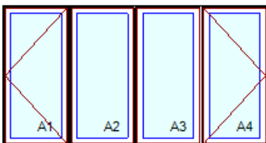
As Viewed From The Exterior