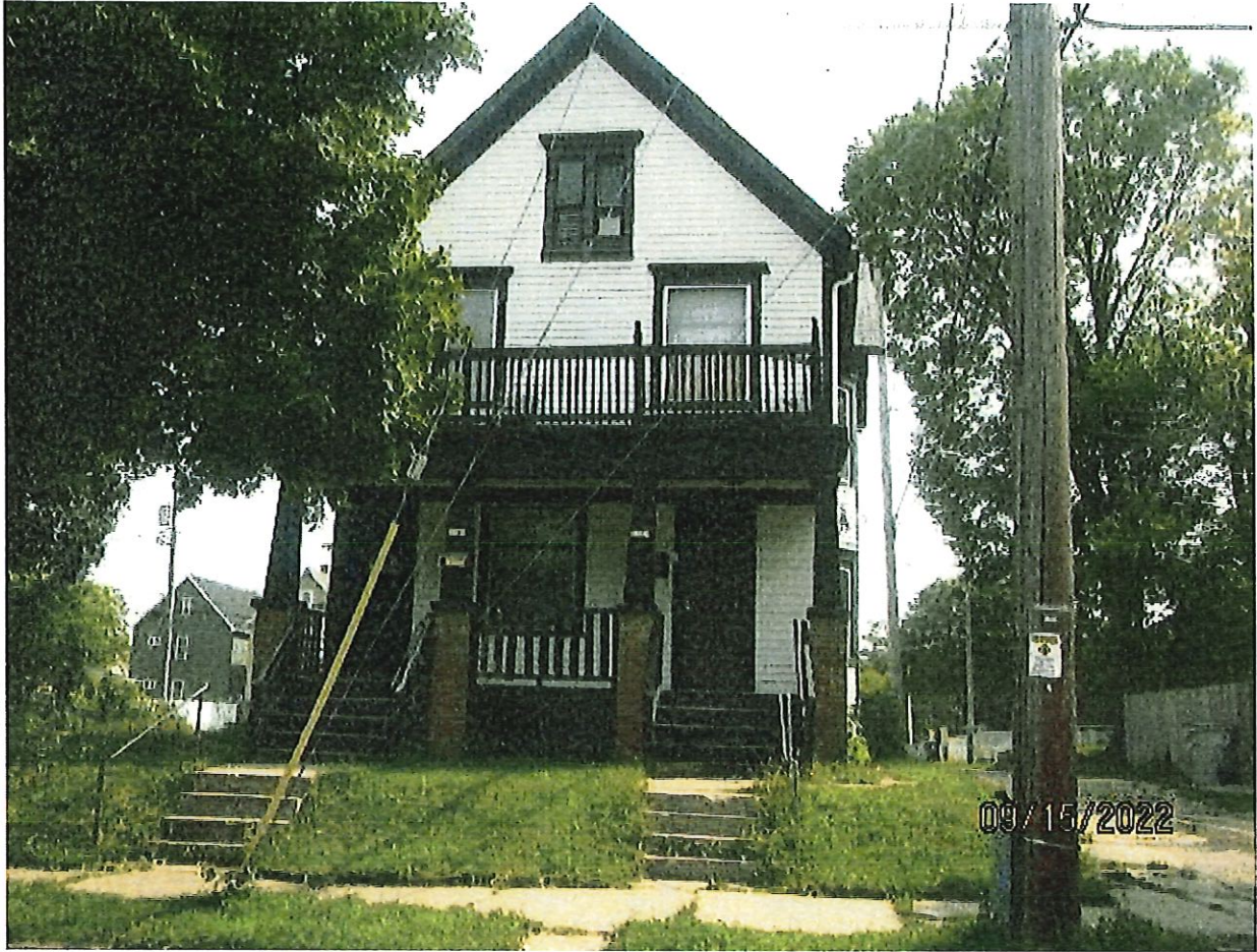
2118-20 North 24 th Pl