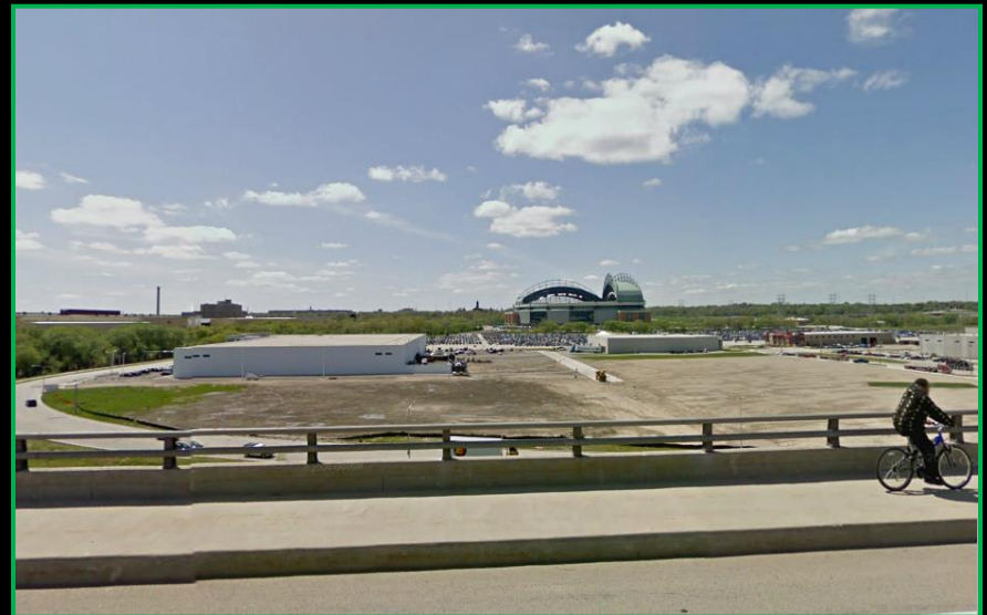
Facing west from S. 35 th St.