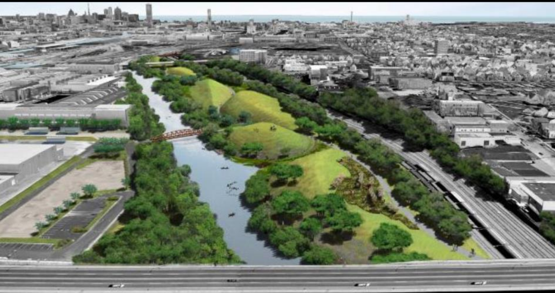
Rendering from Journal Sentinel, August 2012