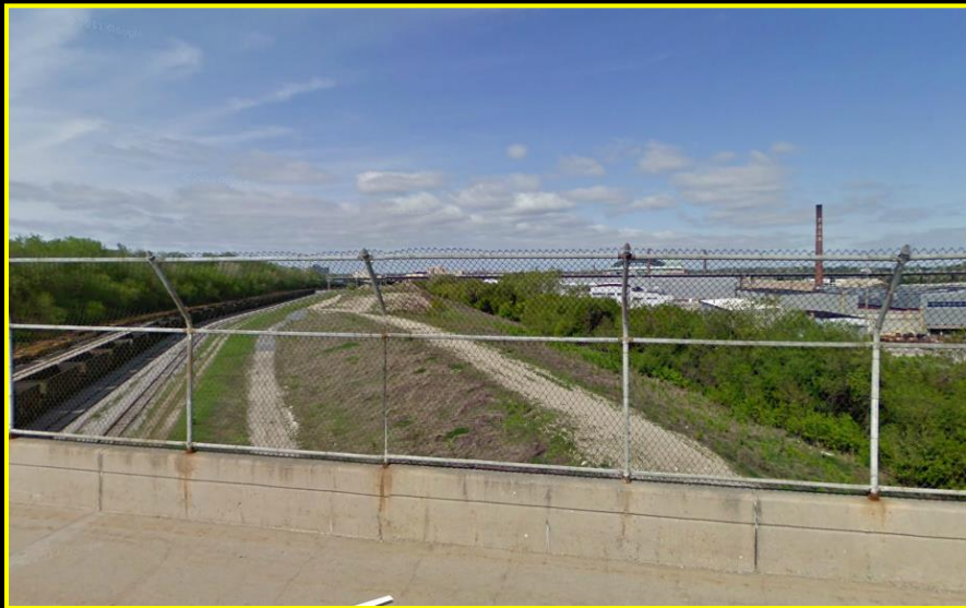
Facing west from S. Layton Blvd.