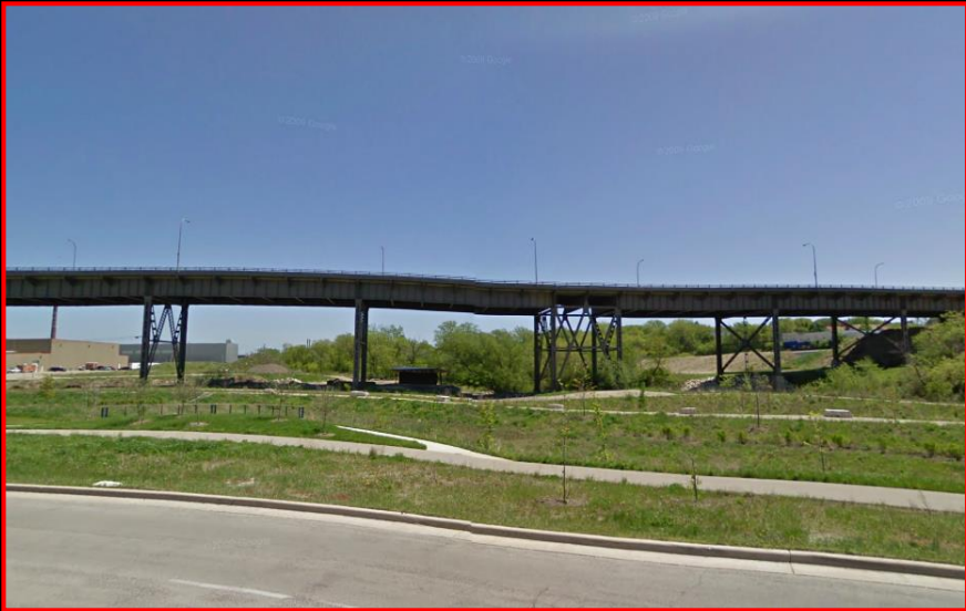
Facing east from W. Canal St.