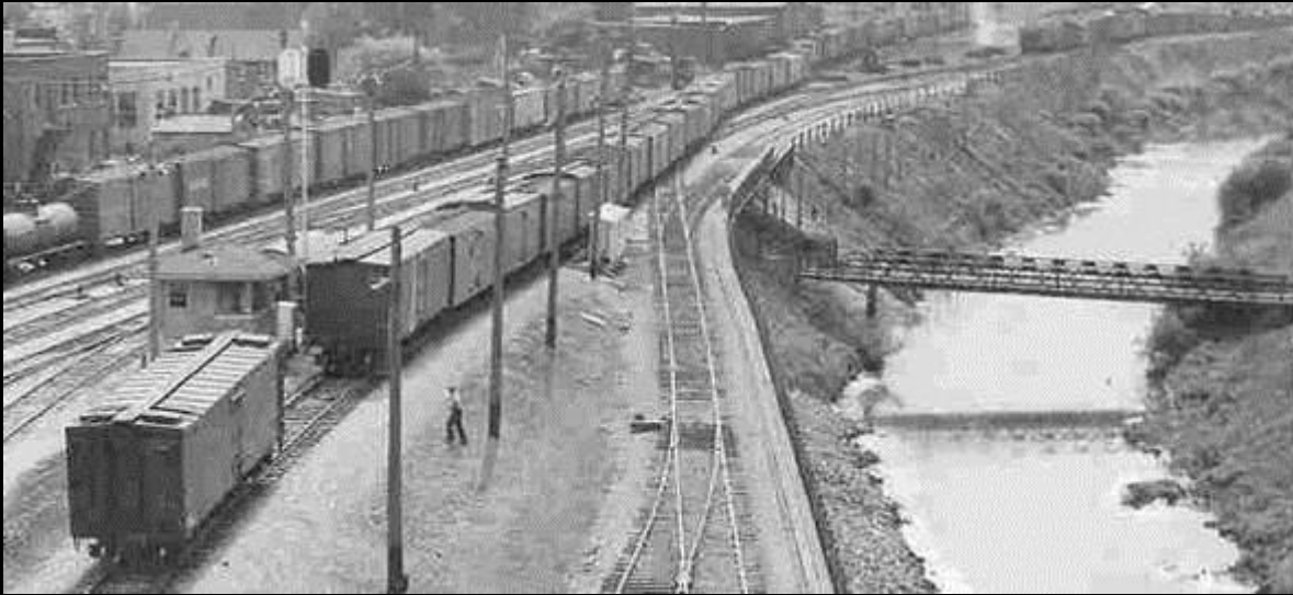
Historic neighborhood connection restored as the Valley Passage