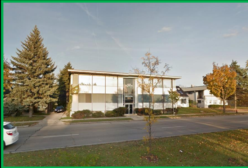
View looking east from West Appleton Avenue