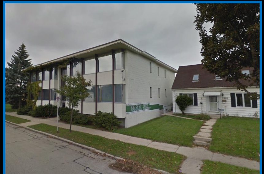
View looking north from West Appleton Avenue