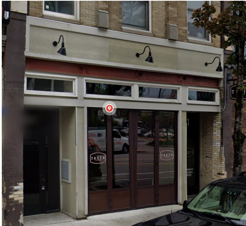
Current appearance, guard will go in front of accordion door.