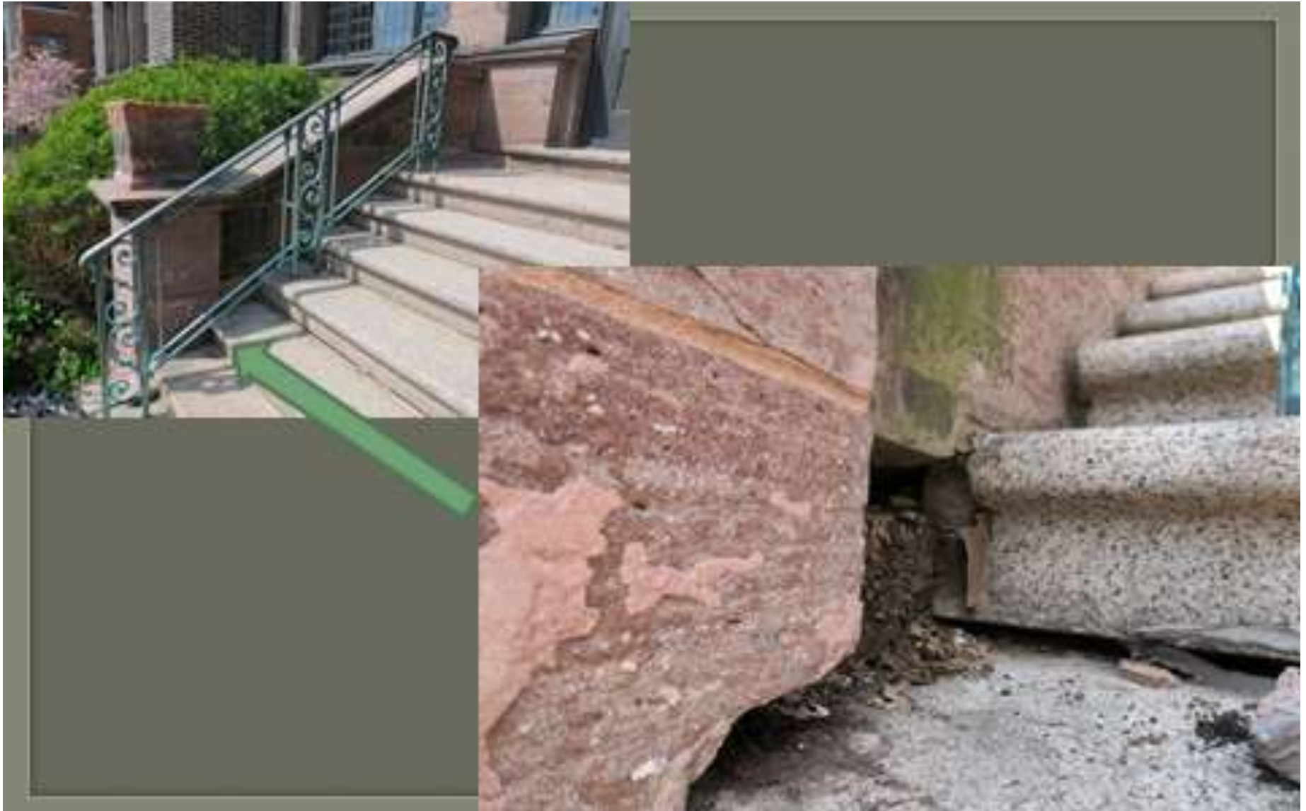
More typical conditons