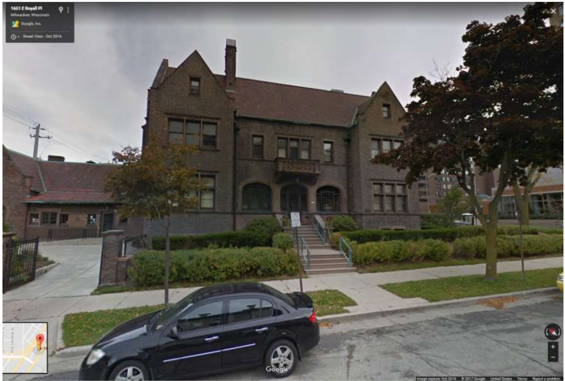
Recent view of south facade