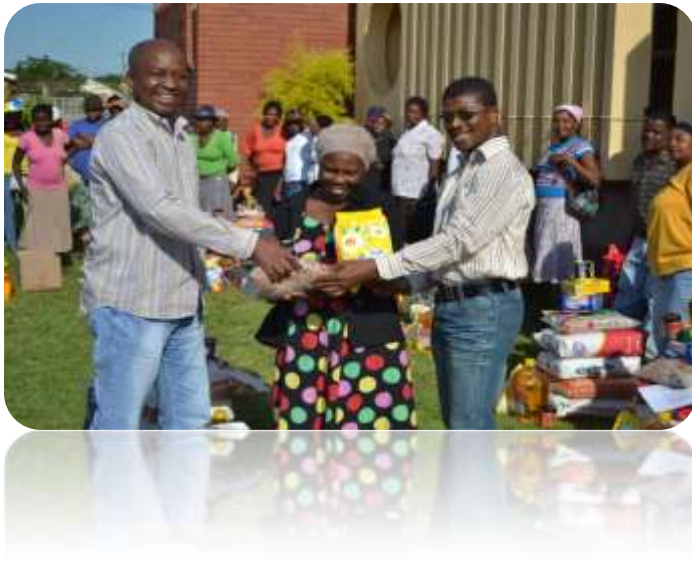
Figure 1 Chairperson with Manager handing over food parcels to the Beneficiaries