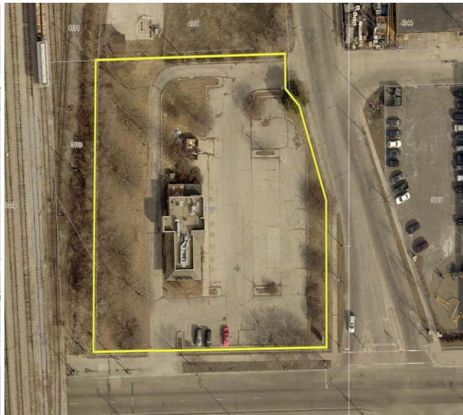
AERIAL PHOTO OF 3100-3120 WEST CAPITOL DRIVE