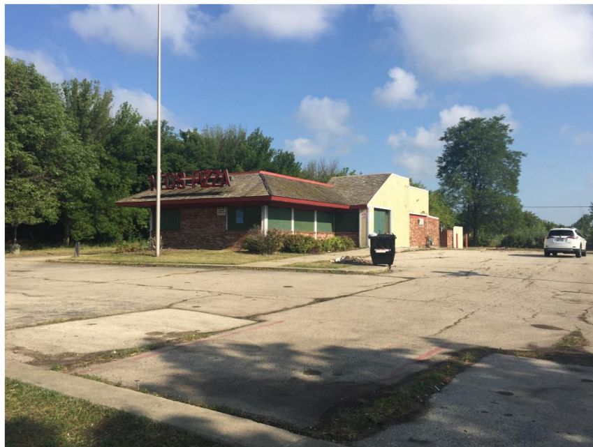
VIEW OF BUILDING LOOKING NORTH FROM WEST CAPITOL DRIVE