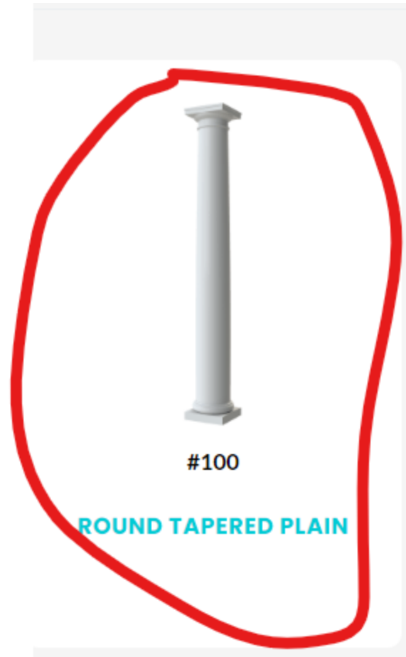
Project plan and replacement column