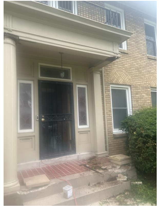
Porch and column existing conditions