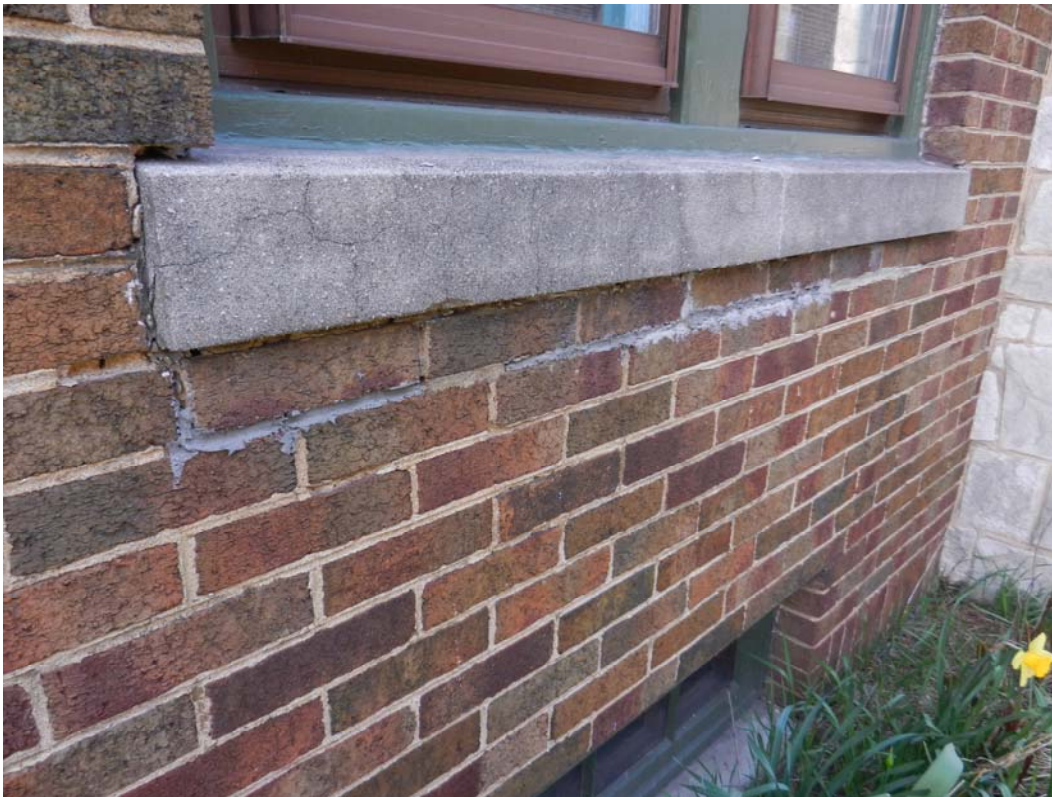
Deterioration below window sills and poorly replaced mortar