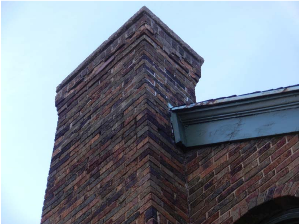
Deteriorated masonry: chimney SW & SE corners