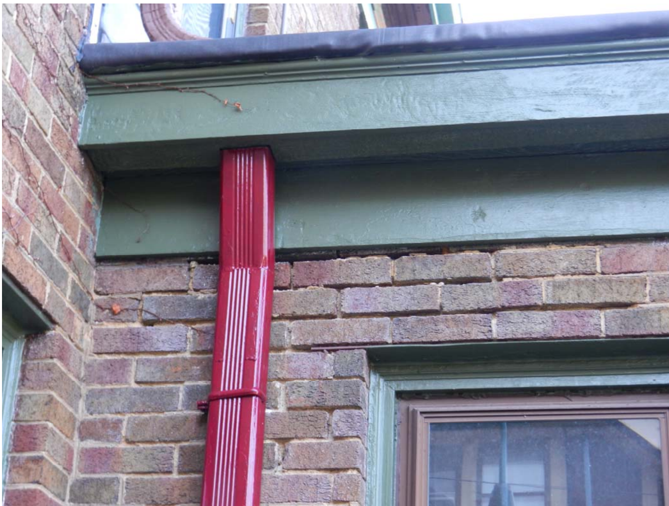
Damaged mortar near downspout