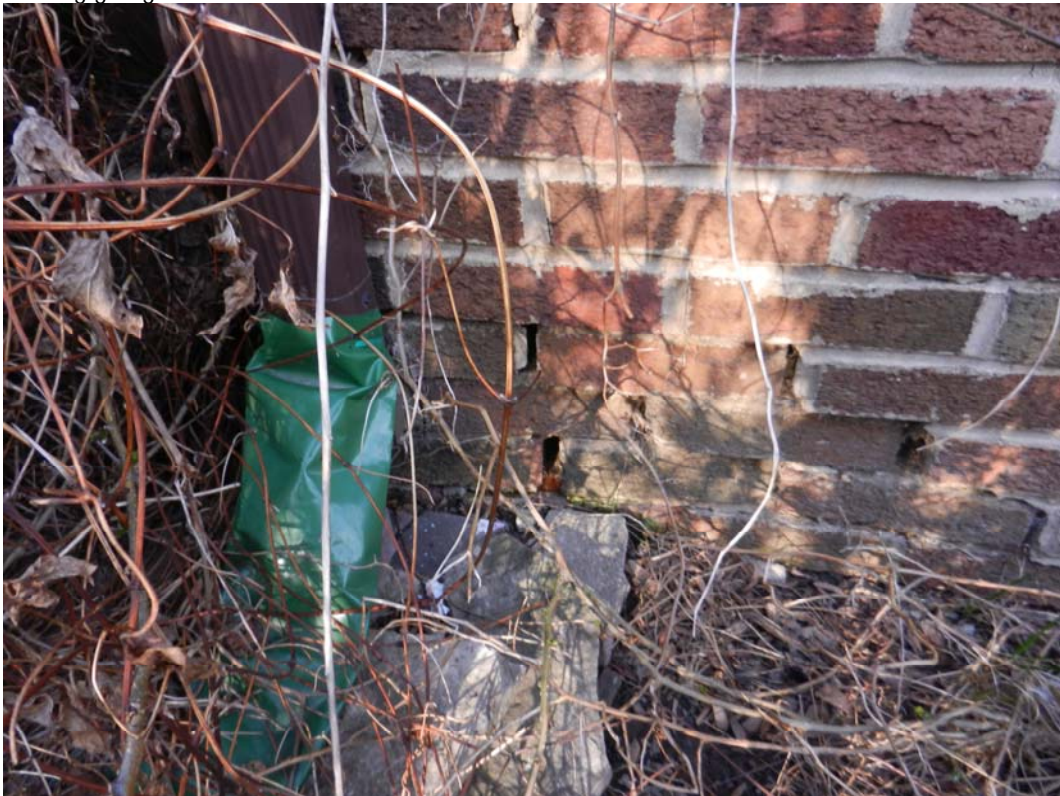
Damaged NW corner of garage.