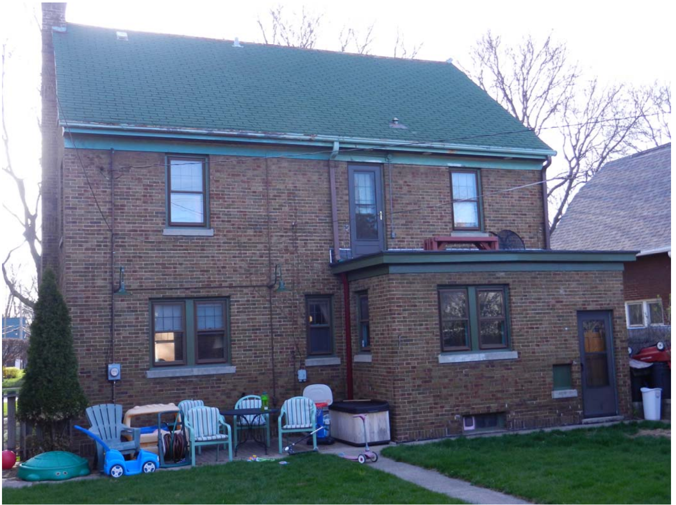
East elevation with second floor porch