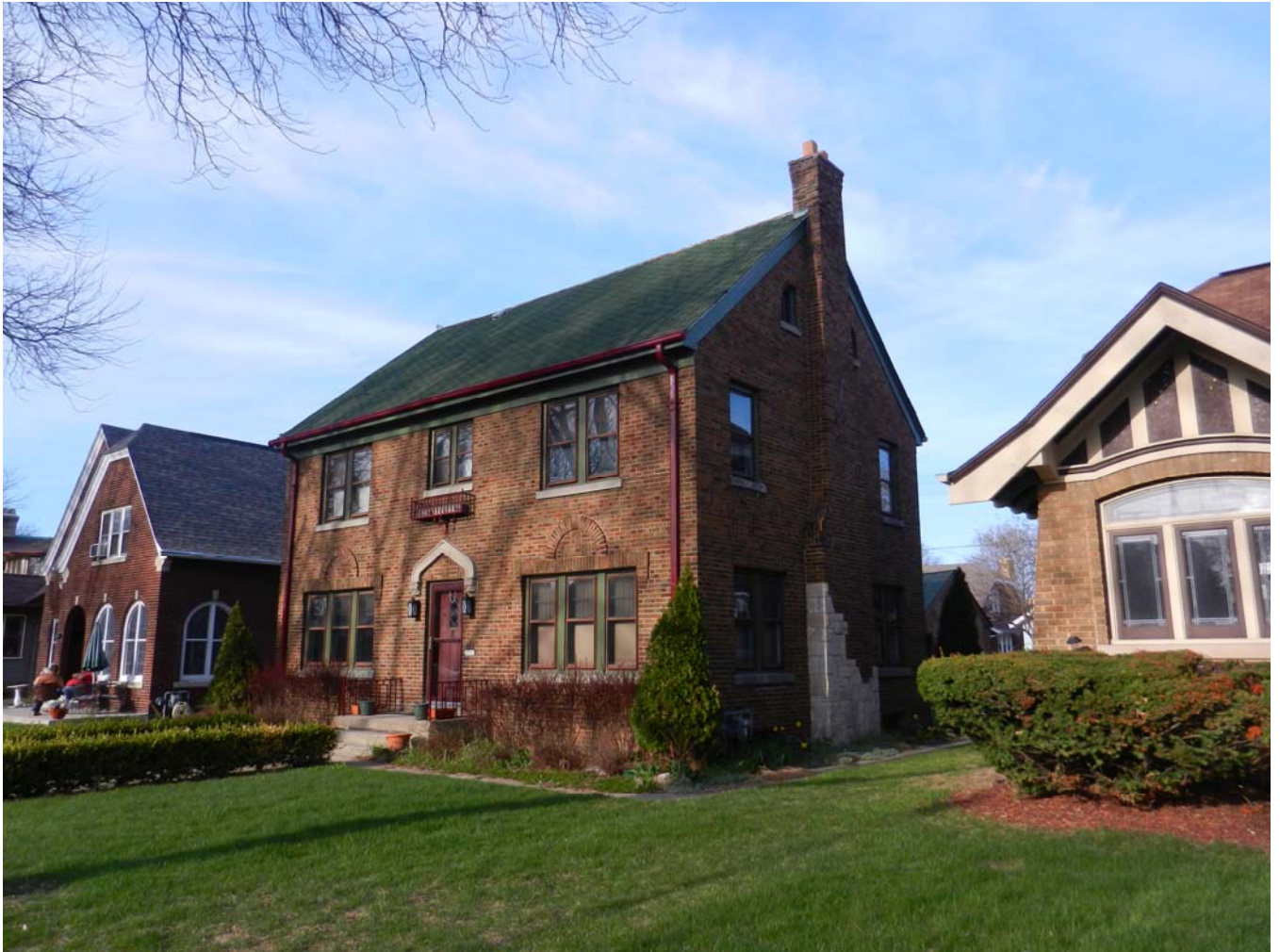
Southwest corner looking north