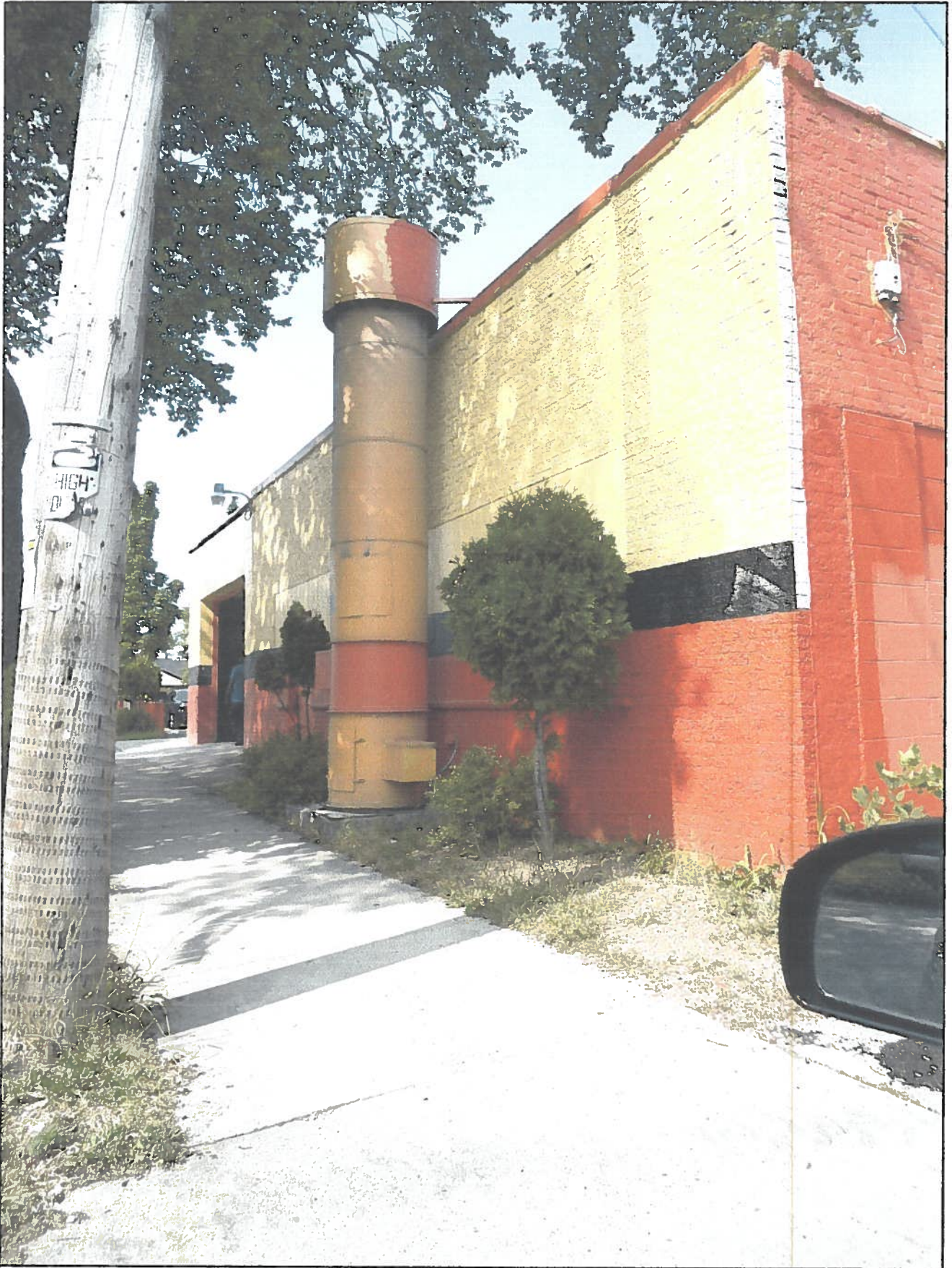
PROJECT: EXHAUST FAN LOCATED IN THE PUBLIC RIGHT OF WAY AT THE WEST SIDE WALL OF PROPERTY AT: 2437 W. NATIONAL AVE MILWAUKEE, WI