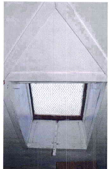
OPENING SKYLIGHT FOR VENTILATION "CHICKEN WIRE" REINFORCED GLASS