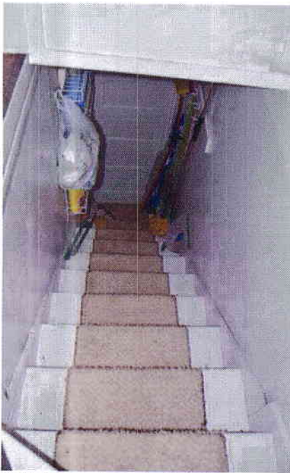
STAIRS DOWN TO KITCHEN