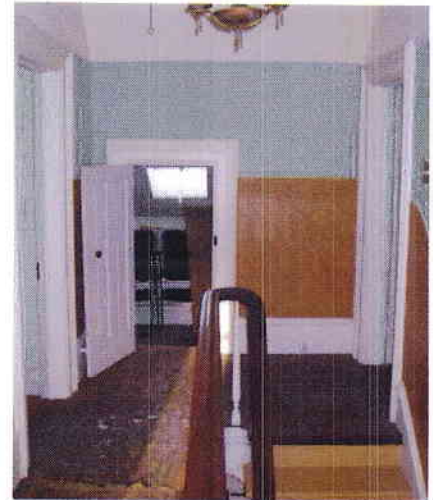
SMALL DOOR ENTRY