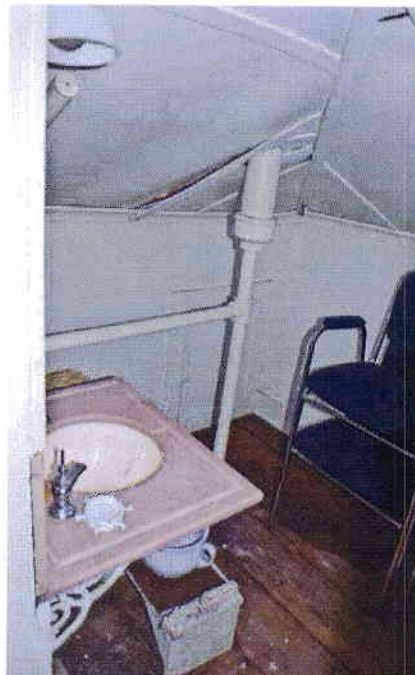
OLD MARBLE SINK; IRON BRACKETS; LEAD PLUMBING