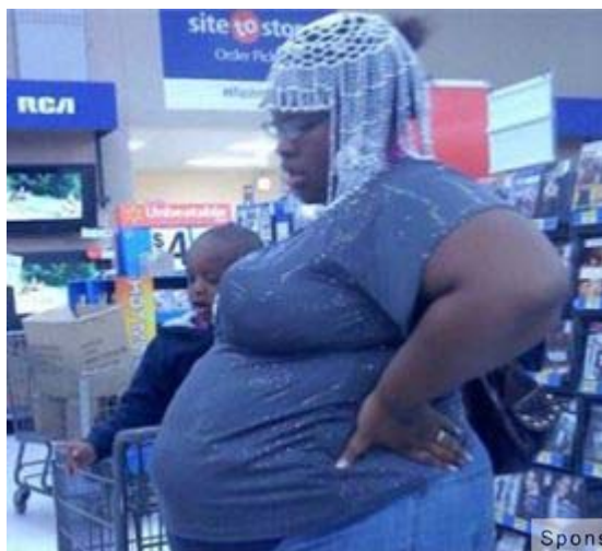
The People of Walmart Never Cease To Amaze