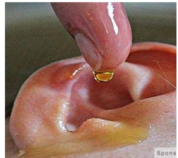
No More Tinnitus: 1 Odd Trick Ends The Ringing Overnight