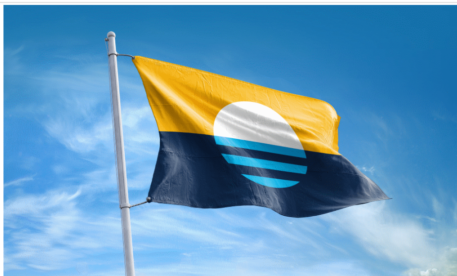
Peoples' Flag of Milwaukee.

Milwaukee will get a new flag, but how or what remain big questions.