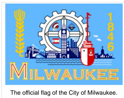
The official flag of the City of Milwaukee.