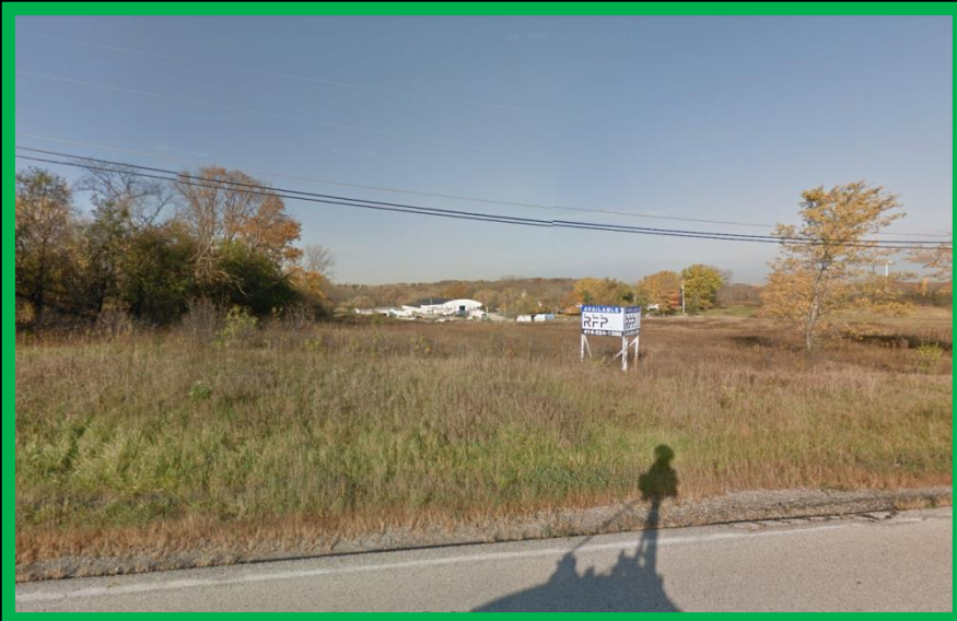
View from North 115th Street looking west