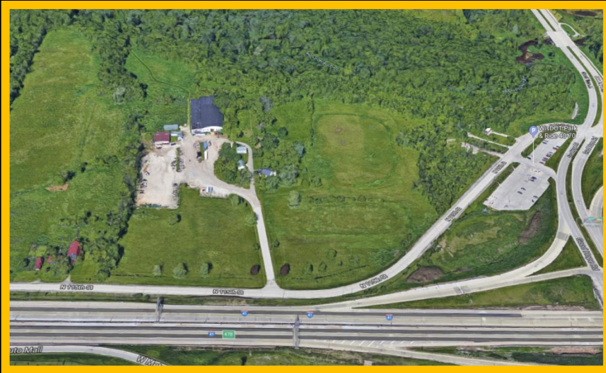
Aerial view looking west