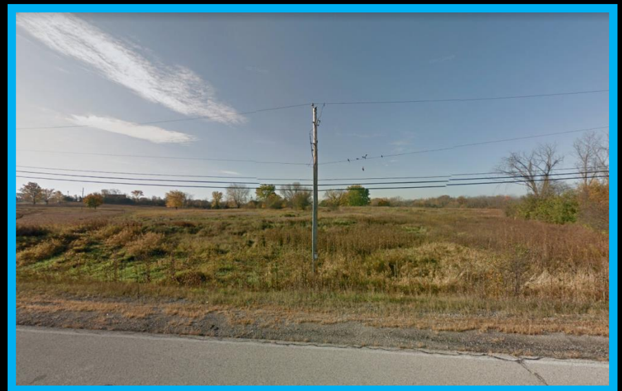
View from North 115th Street looking south-west