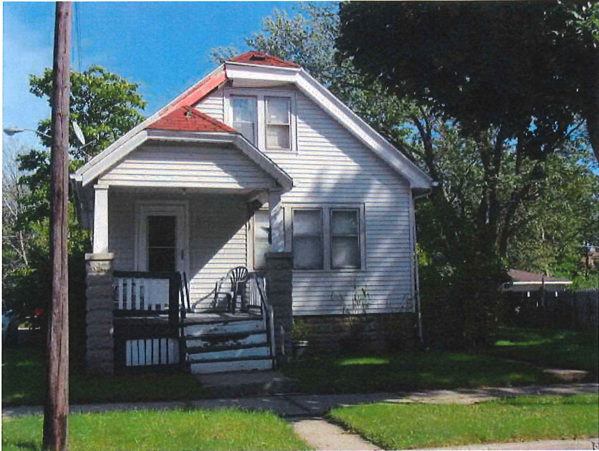
5044 North 33 rd Street