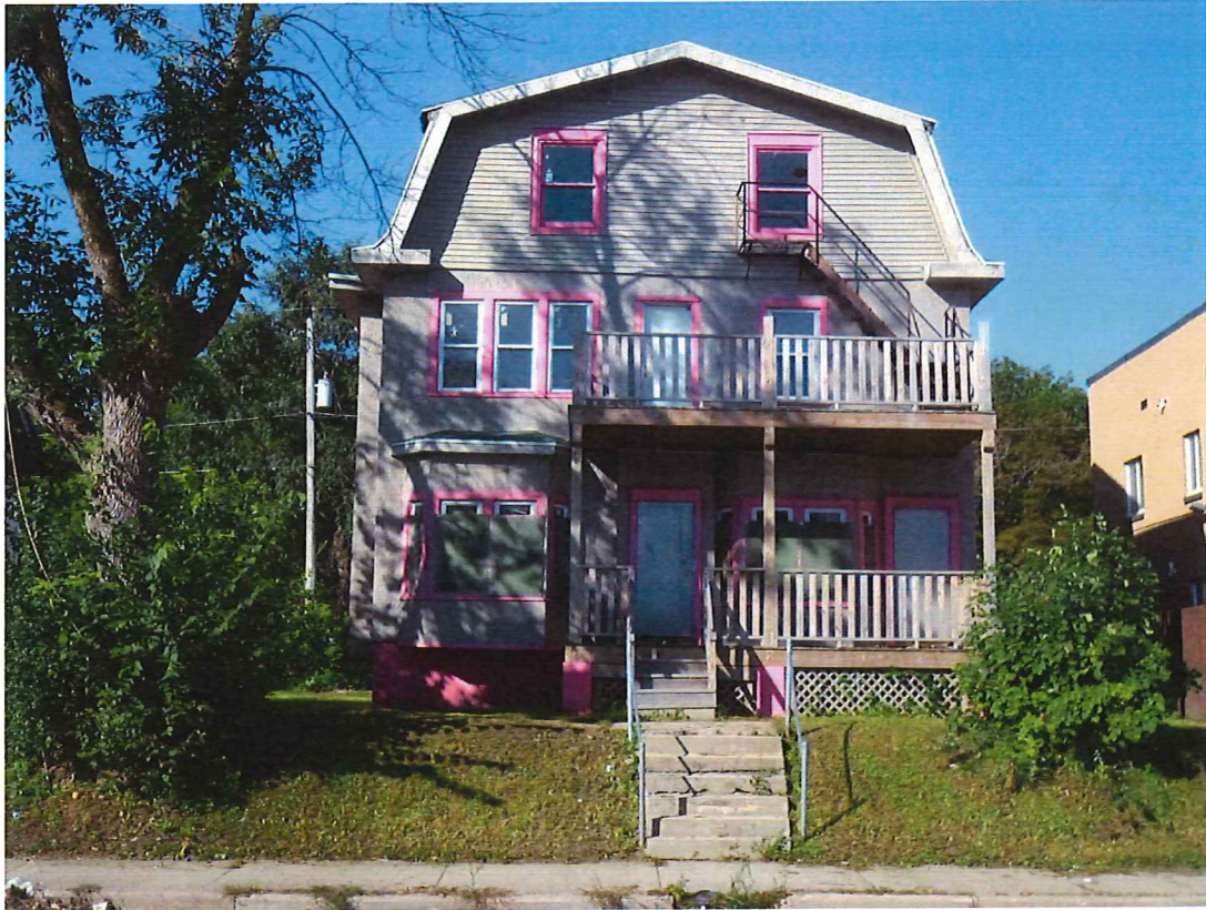
4463 N Hopkins