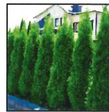
Emerald Arb 7'BB