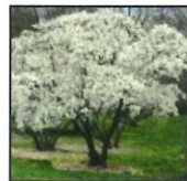
Magnolia Tree 6'BB