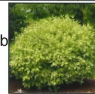
Ivory Halo Dogwood