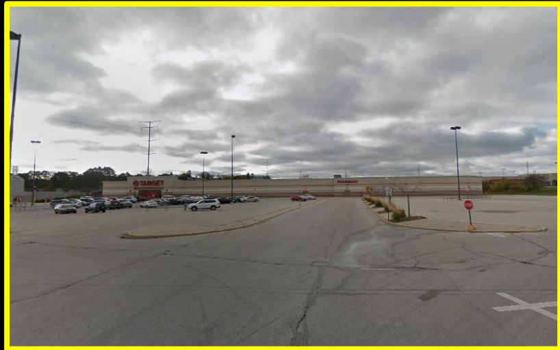
View south from entry off of West Brown Deer Road