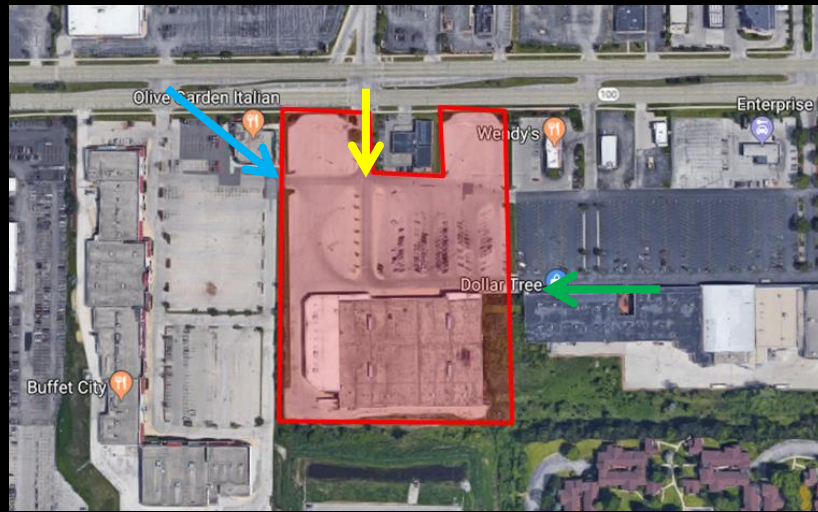
Aerial view with site context annotations