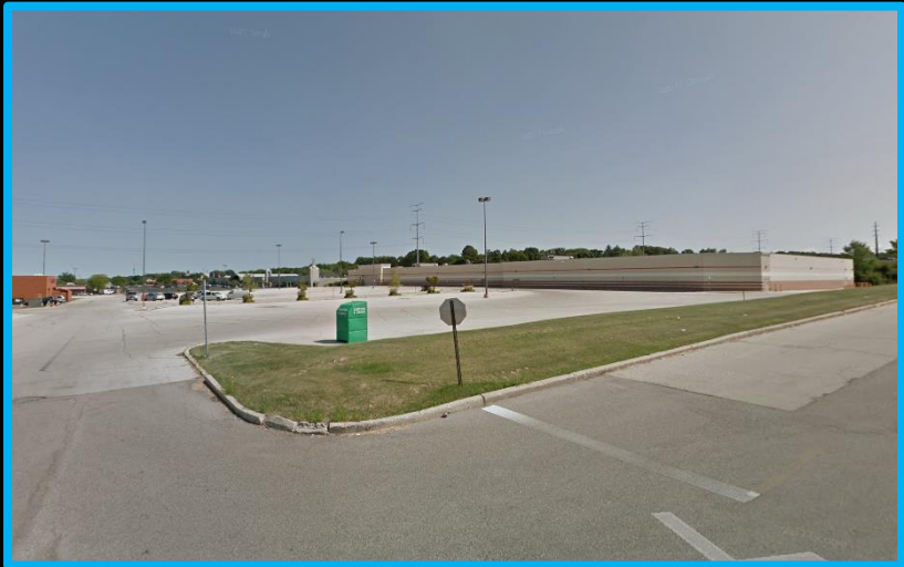
View southeast from west access road