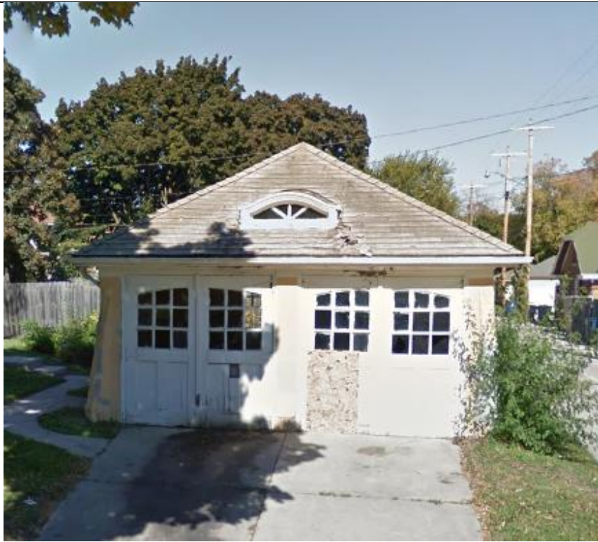
Garage in October 2014