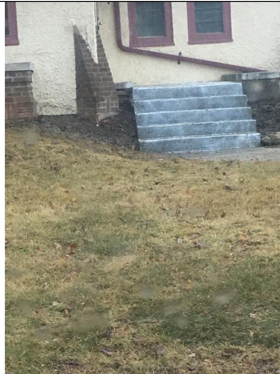
Front porch, January 2017 Railings to be installed around perimeter and at edges of steps. Pickets of railings must be vertical and plumb.