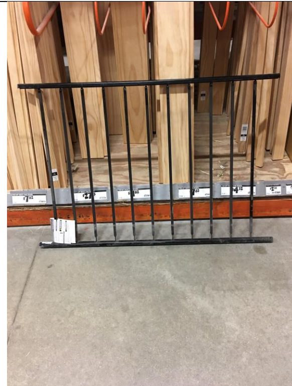
Proposed railing style