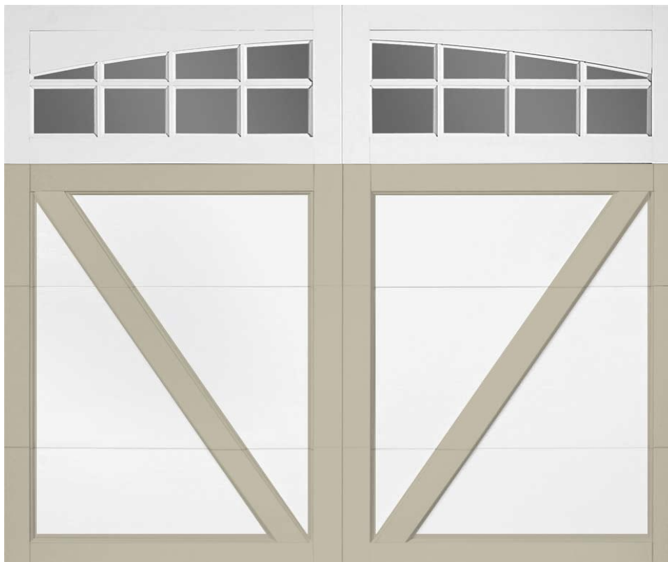
Garage door as proposed. Disregard color.