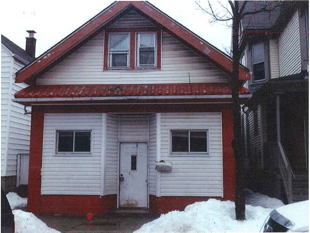
1419 w Scott