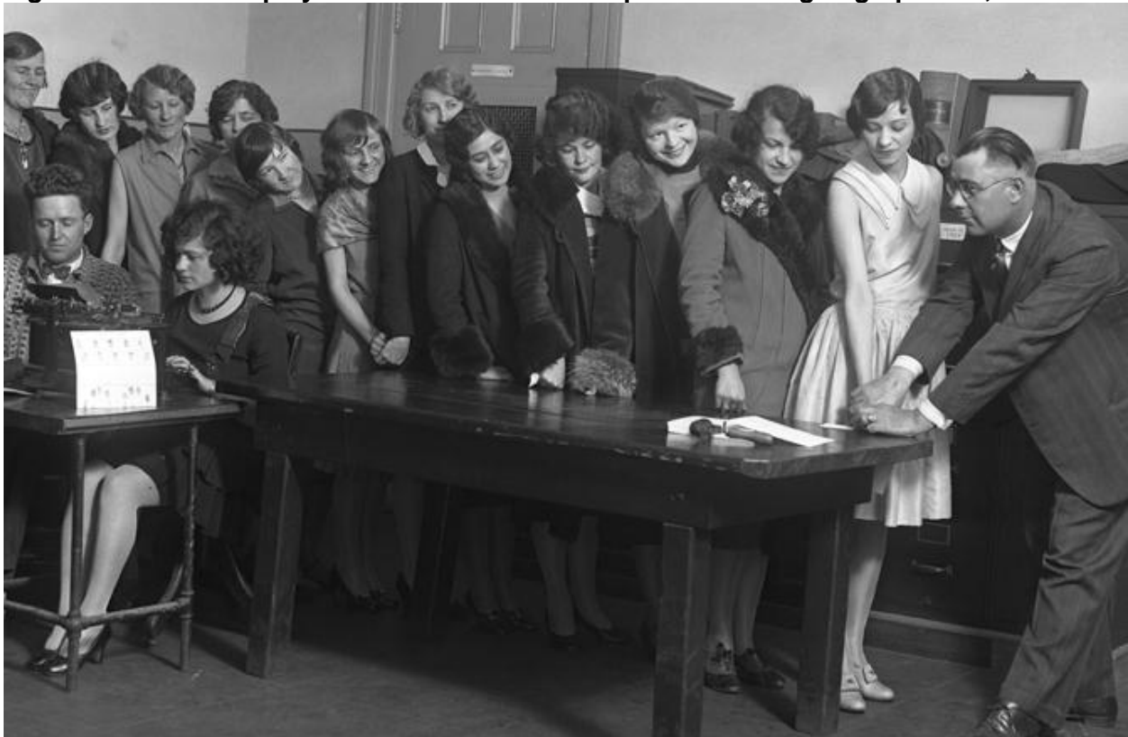
Figure 3. Clerical employees of the L.A. Police Department being fingerprinted, c. 1928.

The FBI acknowledges that the state repository is the most complete and accurate source of criminal history record information within the state. Furthermore, since states maintain records that are not available at the national level, e.g. sex offender records that do not qualify for entry into the National Sex Offender Registry file and arrests and dispositions not reported to the FBI, they have more information to identify individuals who may be unsuitable to work in a particular job.