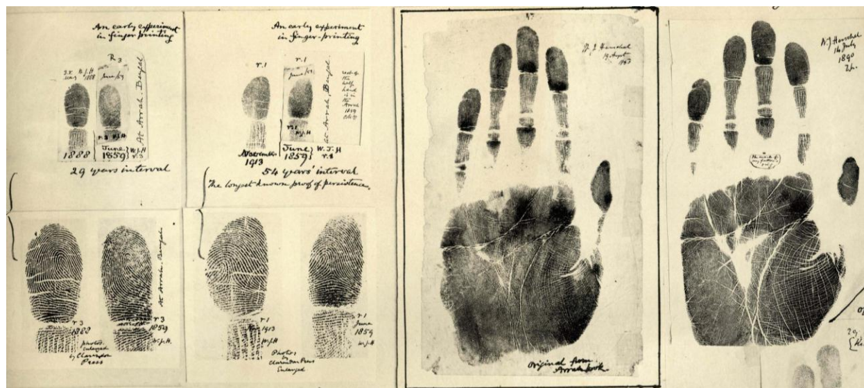
Figure 1. Fingerprints taken c.1859-60 by William James Herschel. 5

When FBI background checks were first authorized for employment purposes during the Cold War, the authorization was limited to federal government workers. Today, FBI background checks are authorized for occupations ranging from port workers and truck drivers to health care workers and school employees.