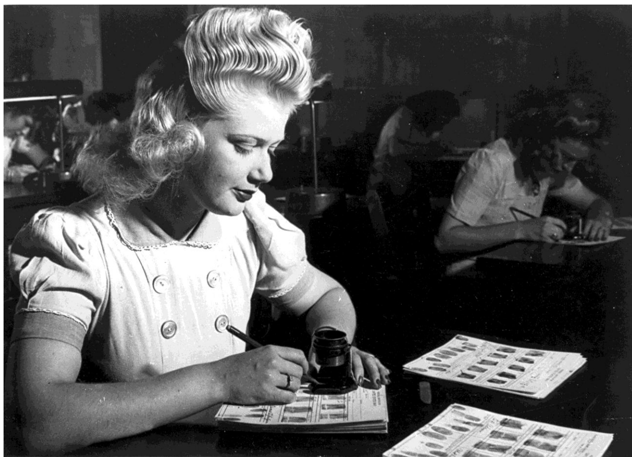
Figure 4. FBI Fingerprinting Experts, Undated.

In reaction to these and other issues with background checks, many jurisdictions have adopted “ban the box” and other fair chance hiring measures. As of February 2015, for instance, at least 13 states and 96 cities and counties have adopted such measures, according to the NELP. Those jurisdiction identified by the NELP with ordinances applying to licensing, specifically, include Indianapolis (February 2014), Newark (September 2012), Seattle (April 2009)