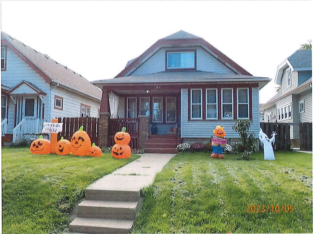
Above: Photo of the Subject Property (3613 W Maple Street)