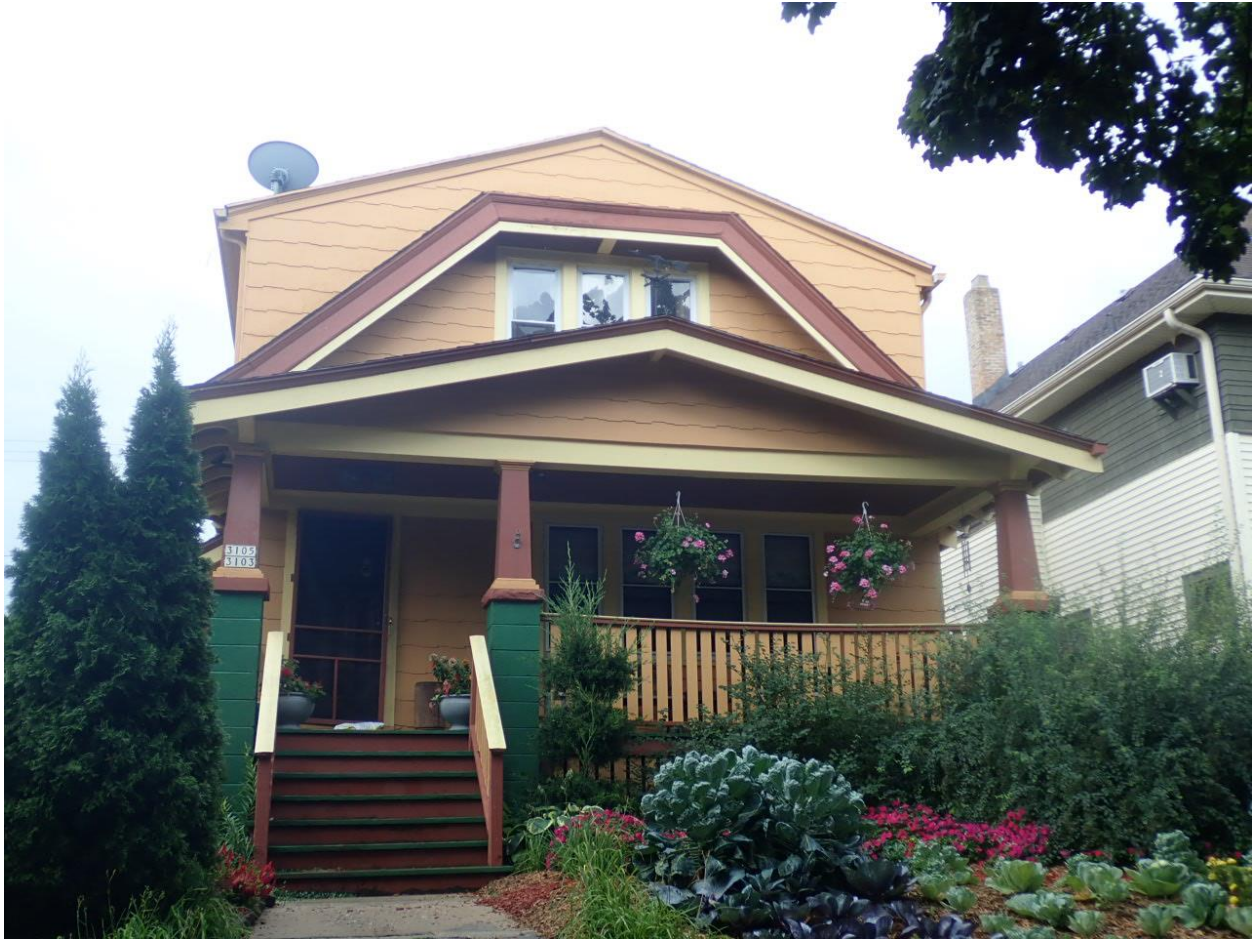
3103-35 W Juneau