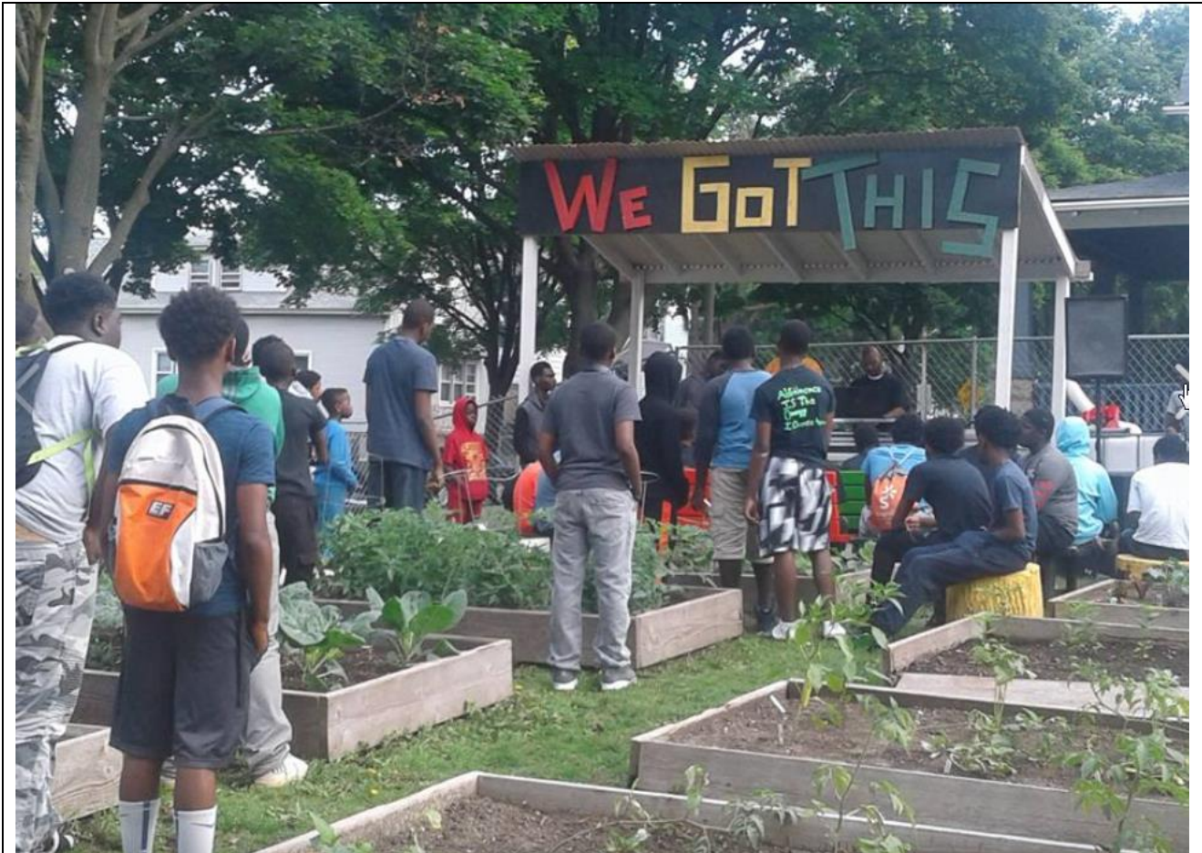
We Got This Community Garden and Event