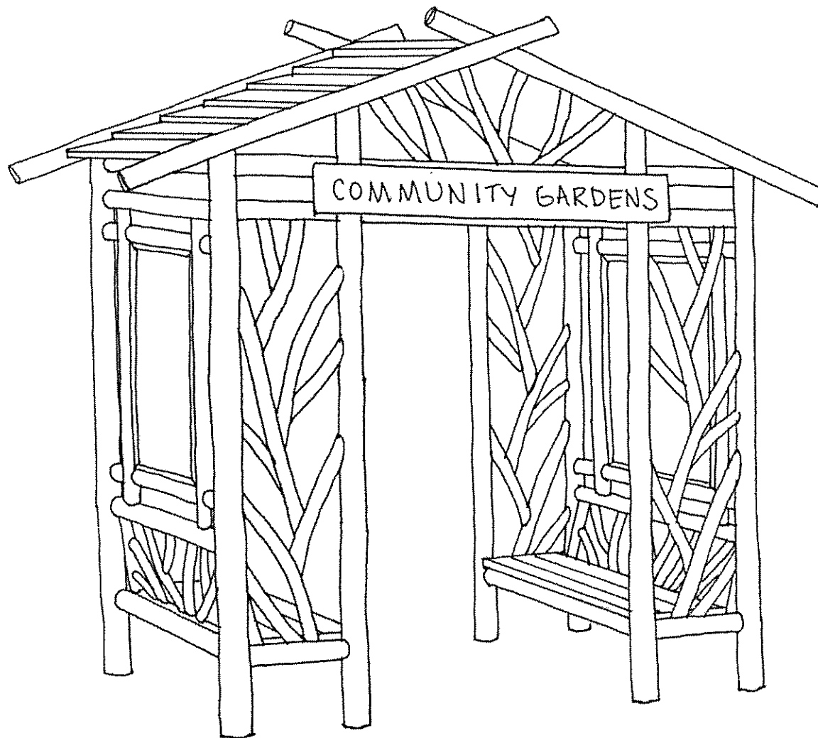
Temporary Garden Gateway approximately 4 feet by 8 feet in plan. Made of de-barked cedar poles and branches.