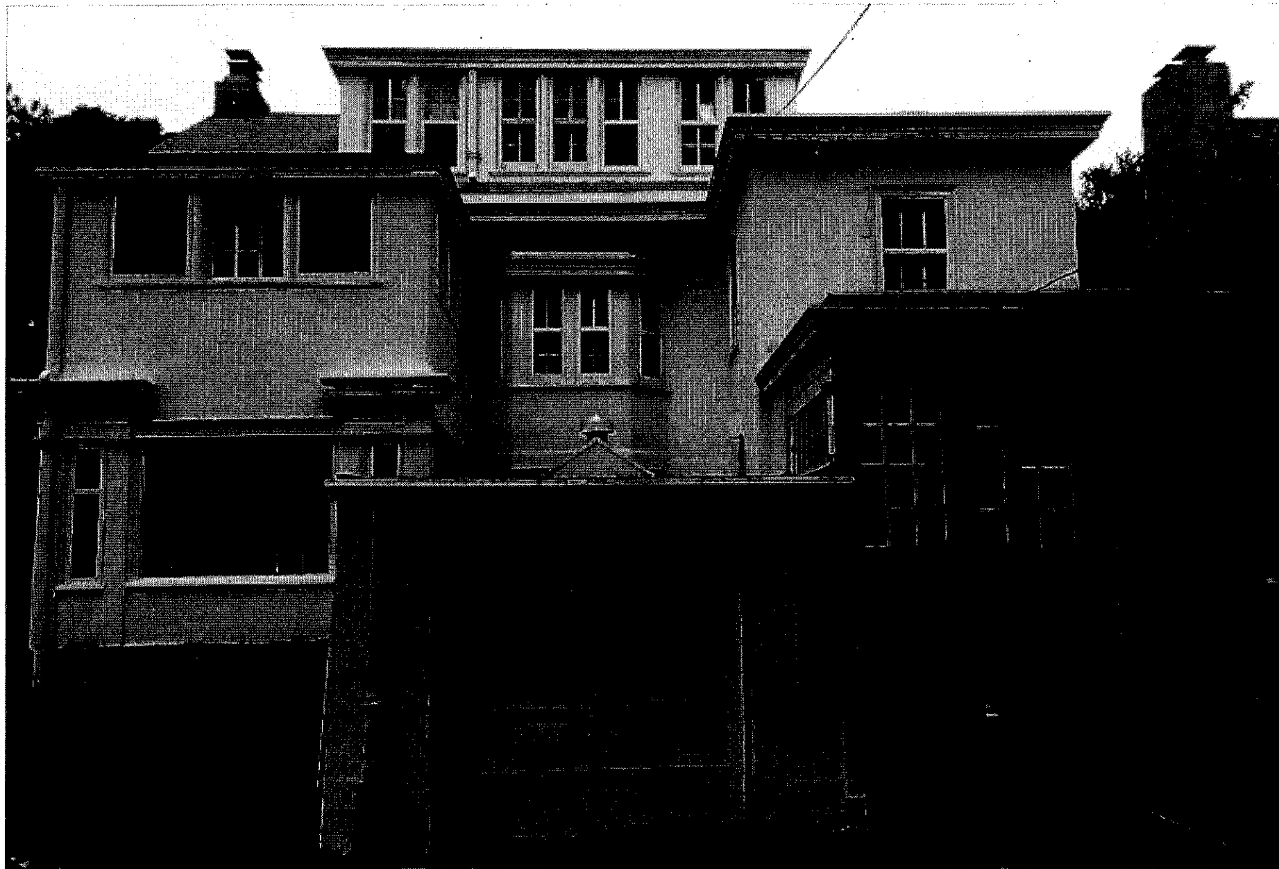
Rear elevation facing east