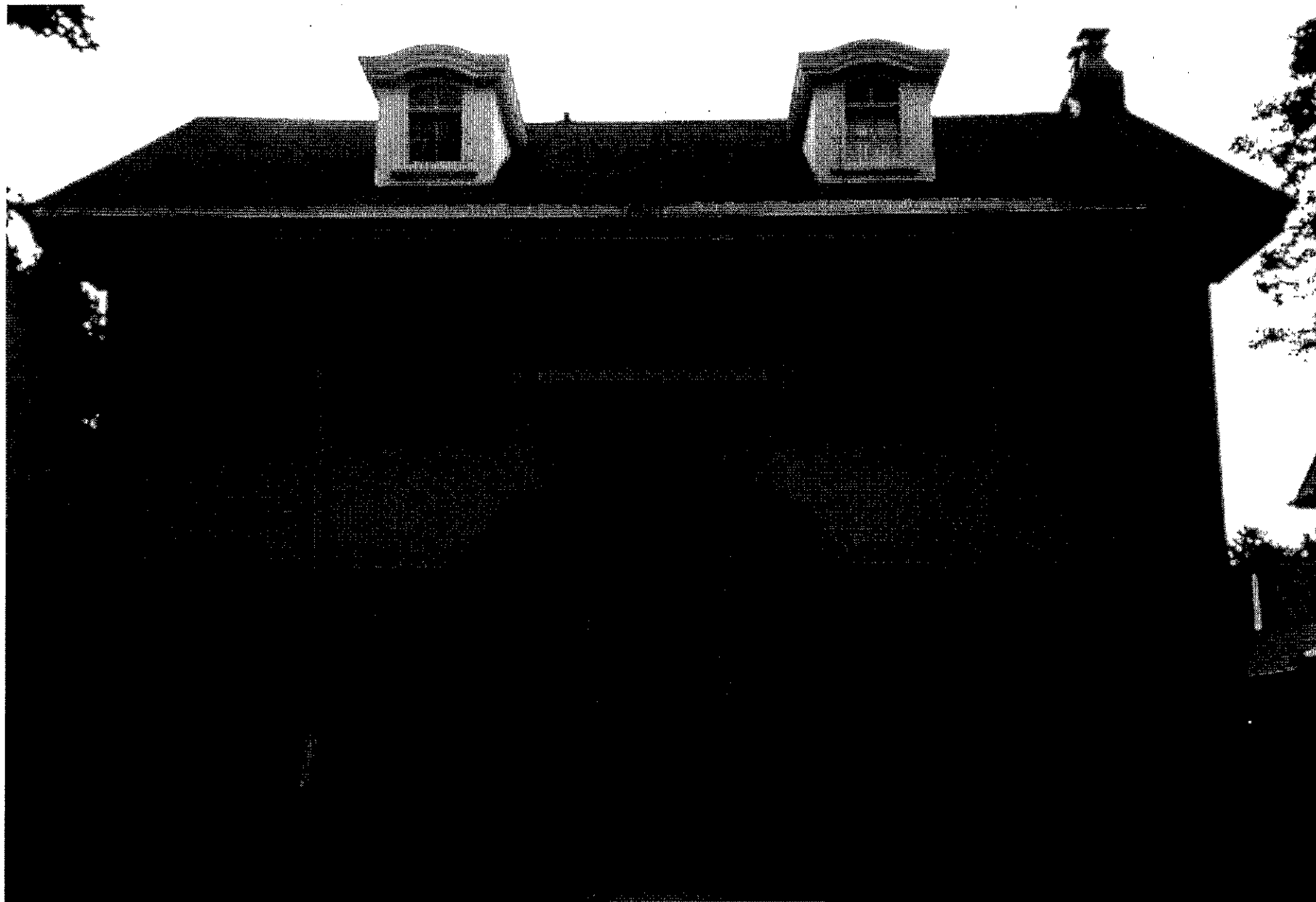
Front elevation facing west