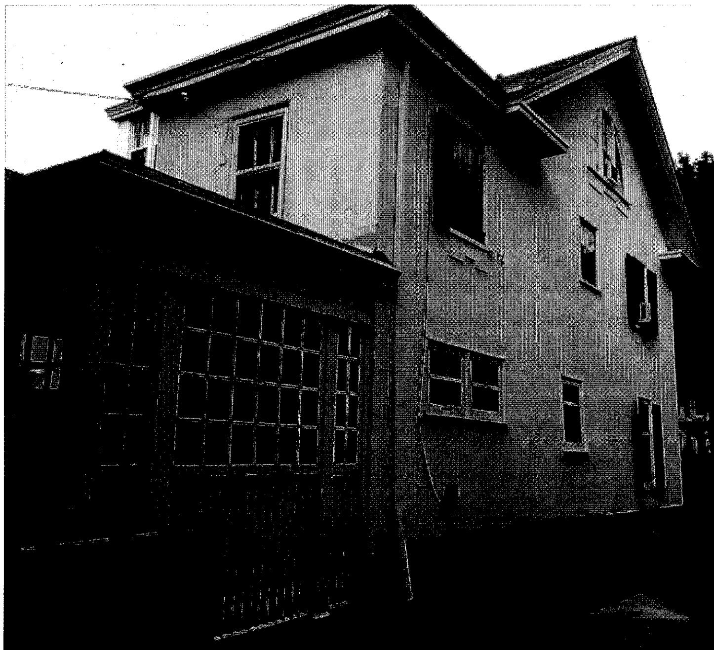
Side elevation facing north