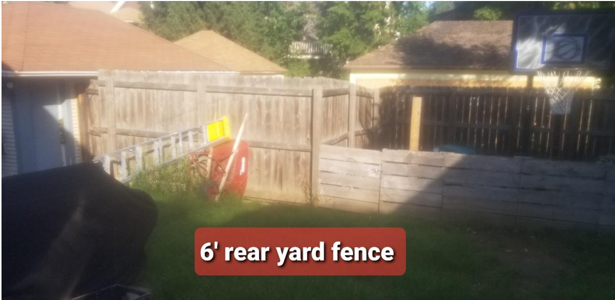
6' rear yard fence