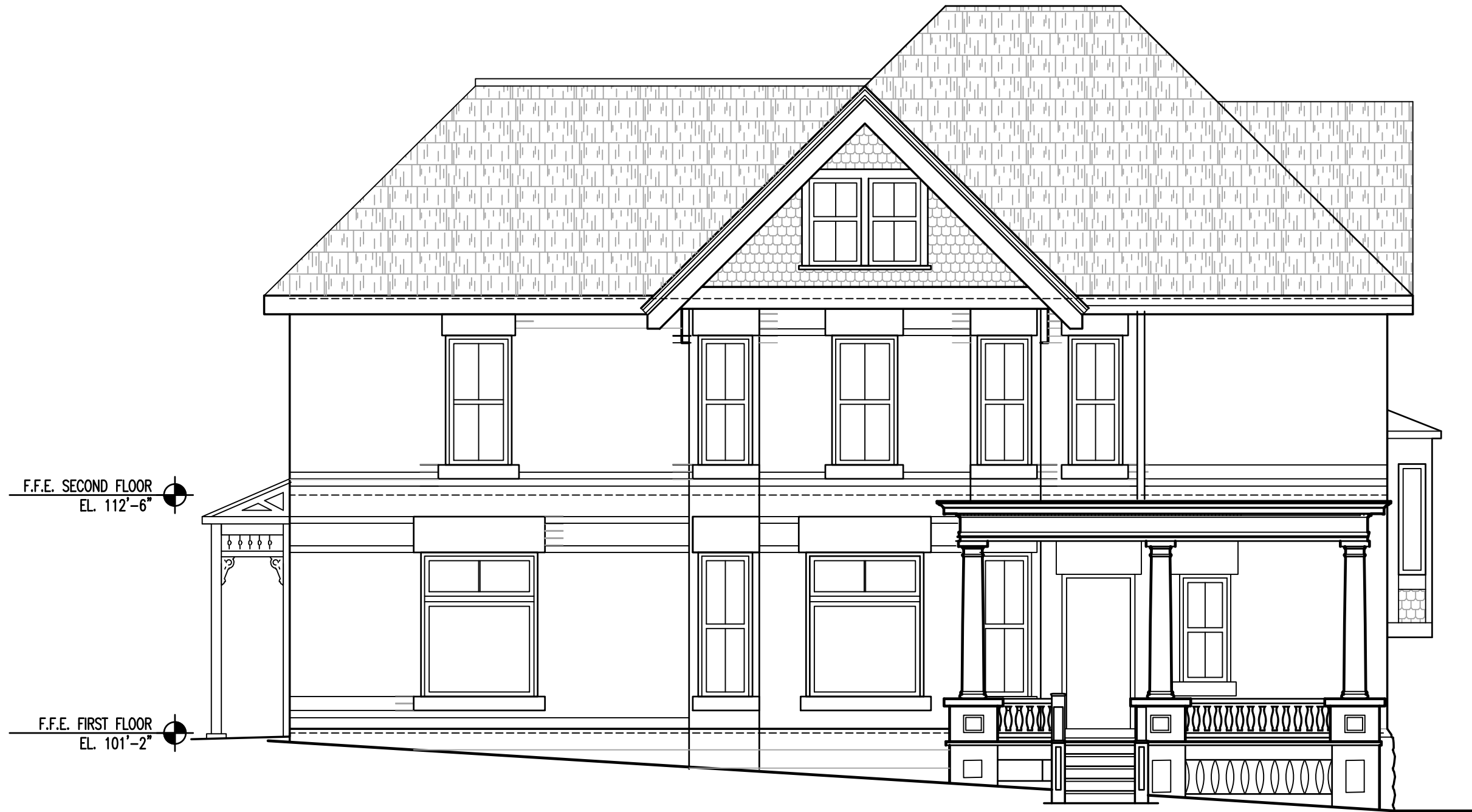
1 West Elevation A401 SCALE: 3/16"=1'-0"