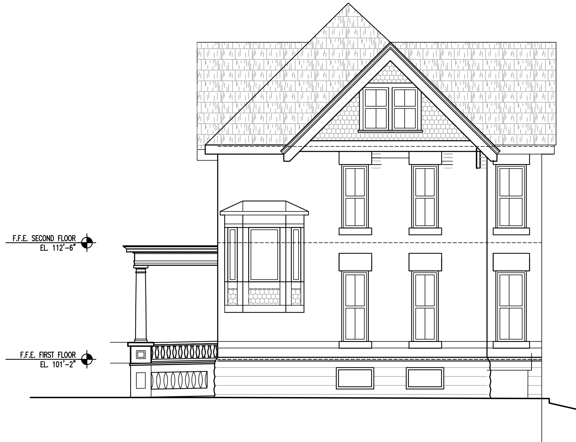
2 South Elevation A401 SCALE: 3/16"=1'-0"